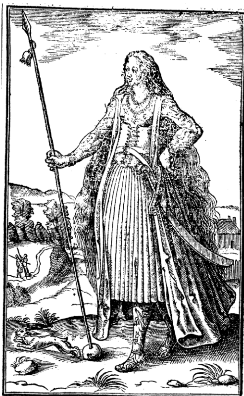
Figure n° 5: Speed's Boudica, an ancient Briton.

The following woodcut, found in both of Speed's works, uses Boudica to represent a female version of an ancient Briton: