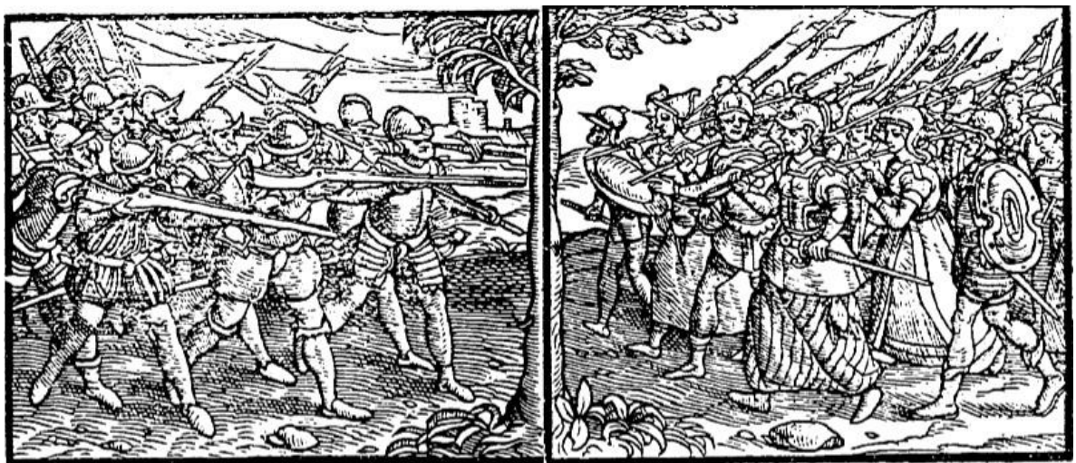
Figure n° 3: Holinshed's Chronicles, the History of Scotland . 1577.

The next two woodcuts are taken from Holinshed's account of the chronicles of Scotland, which used Boece as a source, and show Boece's Voada in sixteenth century dress leading her army of ladies against the Romans who are armed with guns. However, it should be noted that the same woodcuts were recycled for use in different sections of the Chronicles , and the tree in the middle was to facilitate the disassembly and the reassembly of the blocks for other parts of the book. For example, the woodcut on the left was reprinted elsewhere for other historical battles and of the 212 woodcuts made for the 1577 edition over 1000 pictures were produced. 161