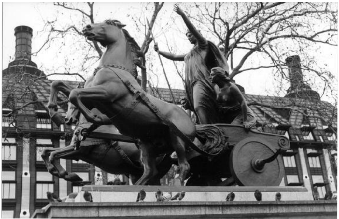
Figure n° 7: Thornycroft's sculpture of Boadicea and her two daughters, (photo: Samantha Frénée).

The use of Boudica in the fields of political and social debate established her importance in representations of the British nation and in representations of the modern woman. By the nineteenth century she had already become the rallying point for national culture and political freedom. One representation of Boudica that gives us the most widely known vision of her is that of Thomas Thornycroft's bronze statue on the banks of the Thames which was erected in front of the Houses of Commons and Big Ben in 1902 (Figure 7).