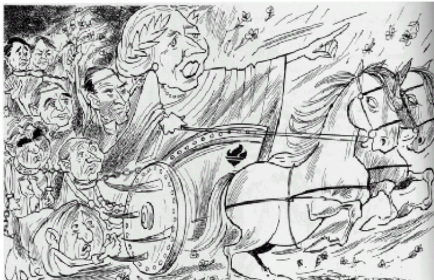
Figure n° 10: The Daily Telegraph , 11 June 1987, cf. Fraser, Illustrations

Figure 9 shows a breast-plated Thatcher driving a Roman style Boudican chariot just after her appearance on American television at the conclusion of the Falklands war. Behind her we can identify the cowboy-figure of Ronald Reagan who is sitting on a small pony watching Thatcher's fiery passage with perplexed astonishment. The following figure, n° 10, shows a rather imperious looking Margaret Thatcher driving the Boudican chariot once again and wearing the laurel leaf crown of victory as she enters Rome under a shower of flowers, thrown by an invisible crowd. This cartoon, published on polling day, 11 June 1987, represents Margaret Thatcher as a Roman senator and military general after her political victory. Here she is shown dragging her political opponents (all men) behind her chariot in chains, and these enemies, now her prisoners, are to be displayed in a public victory before the people. This seems to be a major irony since the historical Boudica was neither victorious nor an imperialist. She was not even queen of Britain.