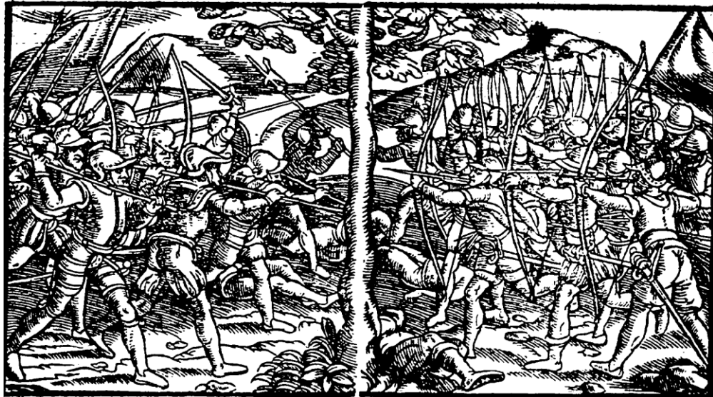
Figure n° 2: Holinshed's Chronicles: the History of England . 1577.

The next two woodcuts are taken from Holinshed's account of the chronicles of Scotland, which used Boece as a source, and show Boece's Voada in sixteenth century dress leading her army of ladies against the Romans who are armed with guns. However, it should be noted that the same woodcuts were recycled for use in different sections of the Chronicles , and the tree in the middle was to facilitate the disassembly and the reassembly of the blocks for other parts of the book. For example, the woodcut on the left was reprinted elsewhere for other historical battles and of the 212 woodcuts made for the 1577 edition over 1000 pictures were produced. 161