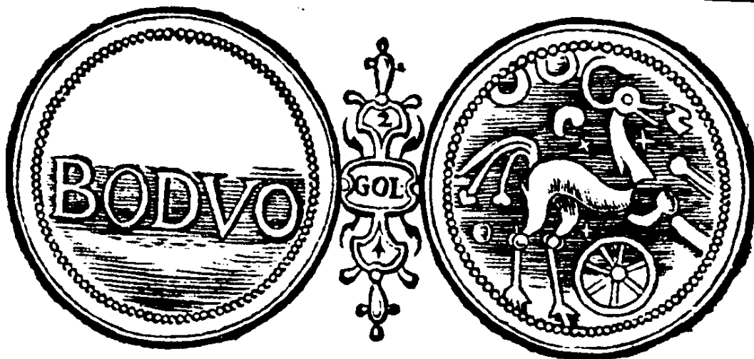
Figure n° 6. The gold coin Speed attributes to Boudica. The History of Great Britaine under the conquest of ye Romans, Saxons, Danes and Normans and The Theatre of the empire of Great Britaine . figure 13, p. 176.

Giving her a number of different names Speed calls the Iceni queen 'Boudicca', 'Voadica' and 'Boduo,' the last name taken from a coin since found to belong to a leader of the Dobunni tribe in Gloucestershire and not to the Iceni tribe at all. 210 Figure 6 below shows the coin that Speed designates as belonging to 'Bodvo'. At the end of a short text about Prasutagus and 'Boduo' he writes: "Her Coyne of gold we have here expressed, the form shield-like, and upon the embossement thus inscribed: BODVO." 211