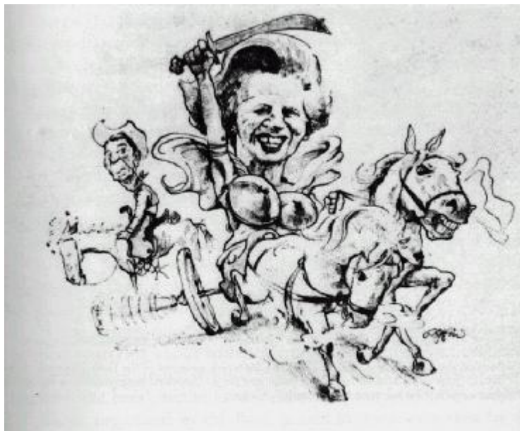
Figure n° 9: The Daily Express , 24 June 1982. cf. Fraser. Illustrations

Iconographic depictions of Boudica also perpetuate the recurrent myths of Boudica's victory and her British sovereignty, which were prevalent in the sixteenth century onwards. Even today Boudica is often cited, for political mileage in cases of political and military success. For example, two newspaper cartoons of Margaret Thatcher identifying her with the victorious Boudica were published after the victory of the Falklands war and on polling day of the general elections of 1987.