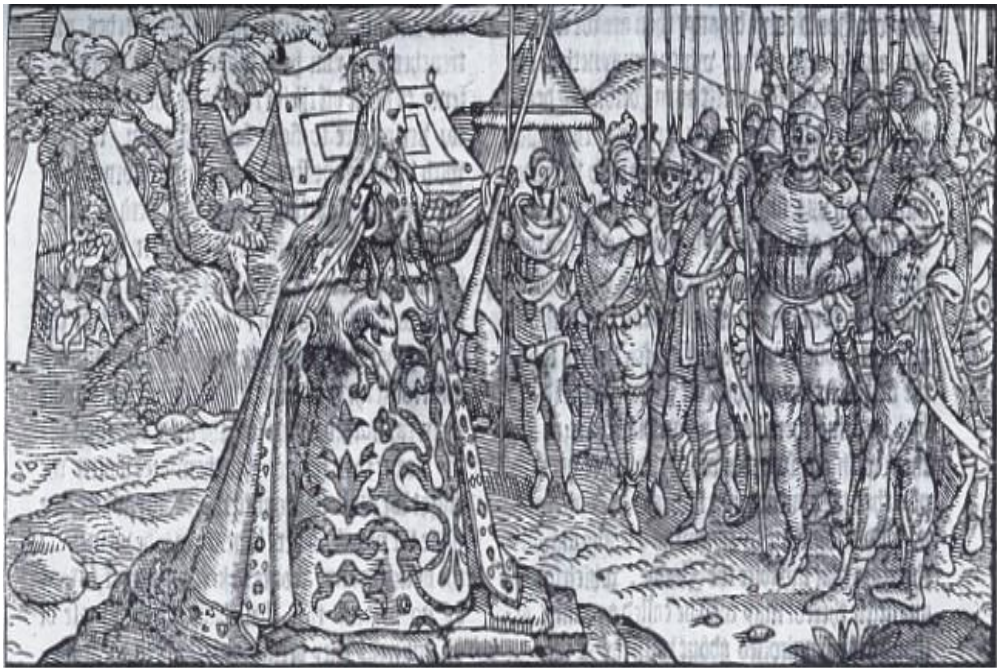
Figure n° 1: Holinshed's Chronicles: the History of England . 1577.

This is certainly the case in the woodcut below showing Boudica's address to her troops just before battle is joined with the Romans. In figure 1 Boudica is wearing Tudor dress as are her men and she also carries the Elizabethan paraphernalia of sovereignty. This is a visual representation of Boudica as described by Dio, brought to the public's attention for the first time really but in Elizabethan expression. Under her cloak there is a hare which she is just about to release in order to prophesise victory for the Britons.