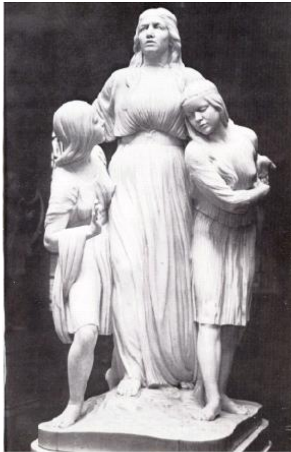
Figure n° 8: Boudica and her daughters. Webster, G. Boudica, The British Revolt Against Rome AD 60 . London: Routledge, 1993. Illustration 1, p. 65.

A second, simpler representation of Boudica, is that of the marble statue of Buddug/Boadicea 18 and her daughters which stands in the Civic Hall of Cardiff. It was produced by the sculptor, James Harvard Thomas in 1916 to commemorate famous figures from Welsh history and shows none of the aggressive fury of many of the other depictions. It highlights rather, the instinct of a mother; Boudica's arms encircle her children, one hand is open towards the viewer as if she were appealing for compassion and understanding in showing the childlike figures of her two daughters whilst her eyes are fixed firmly on the horizon, alert to the danger that threatens her family.