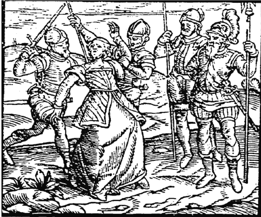
Figure n°4: Holinshed's Chronicles; the History of Scotland . 1577.

The final woodcut shows Voada's daughter, Vodicia, being executed by the Roman soldiers for her insurgence and the renewal of the rebellion first initiated by her mother.