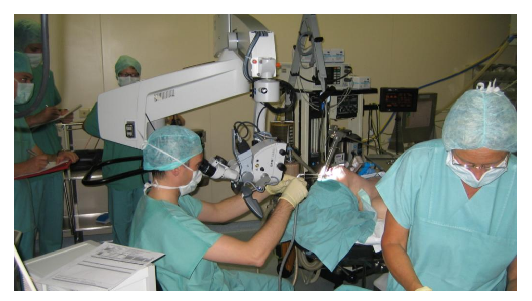
Figure 1: Decubitus dorsal position with the surgeon at the head of the table

microscope, Carl Zeiss, Germany) by removal of the rostrum of the sphenoid. The sphenoid sinus mucous membrane was then entirely excised. The sellar floor was taken off to expose the dura mater of the pituitary fossa as well as the anterior limit of the left and right cavernous sinus.