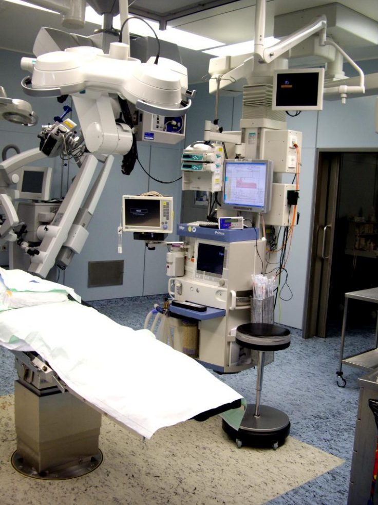
Leipzig University Hospital, Neurosurgical Operative Room