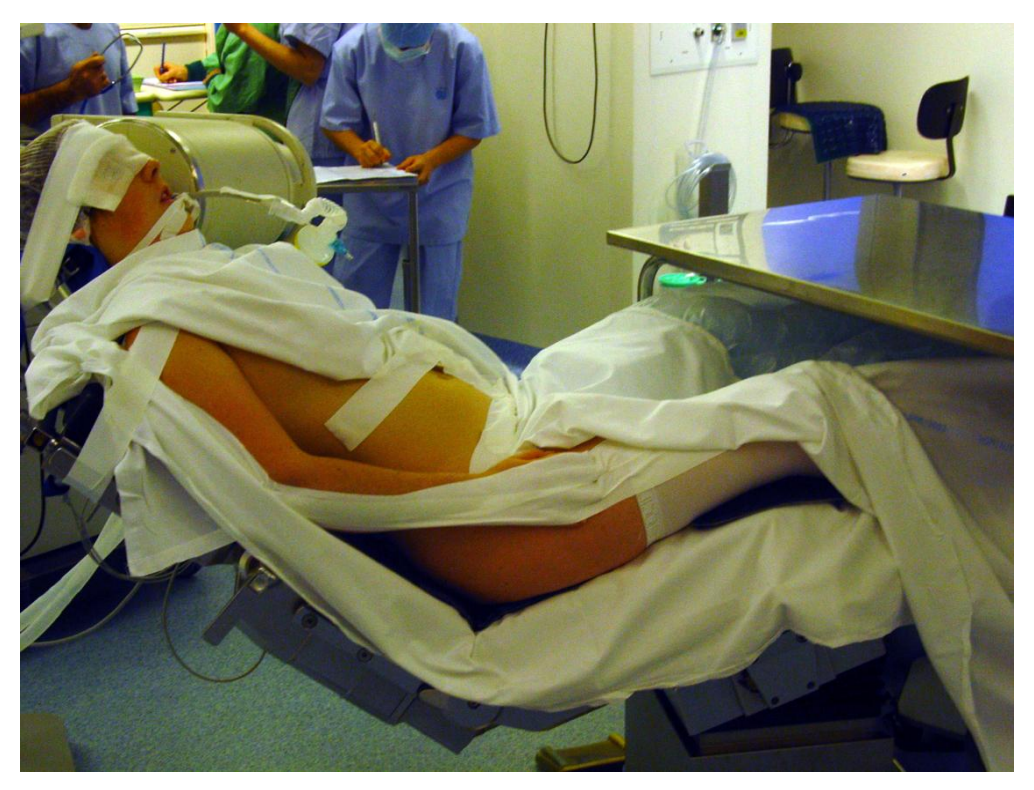
Figure 2: Lawn-chair position