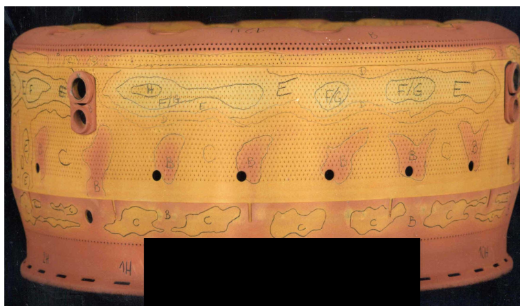
Figure 1.4: A combustion chamber of Turboméca

In real configurations, direct numerical computations are beyond reach. This is mostly due to the large number of perforations (approximately 2000) and to their small characteristic lengths (diameter of a perforation 0.5mm; spacing 5mm) with respect to the wave length (0.5m approximately). In this project, we are interested in giving a rigorous explanation to the approximate transmission classically used to model the multiperforated plates.