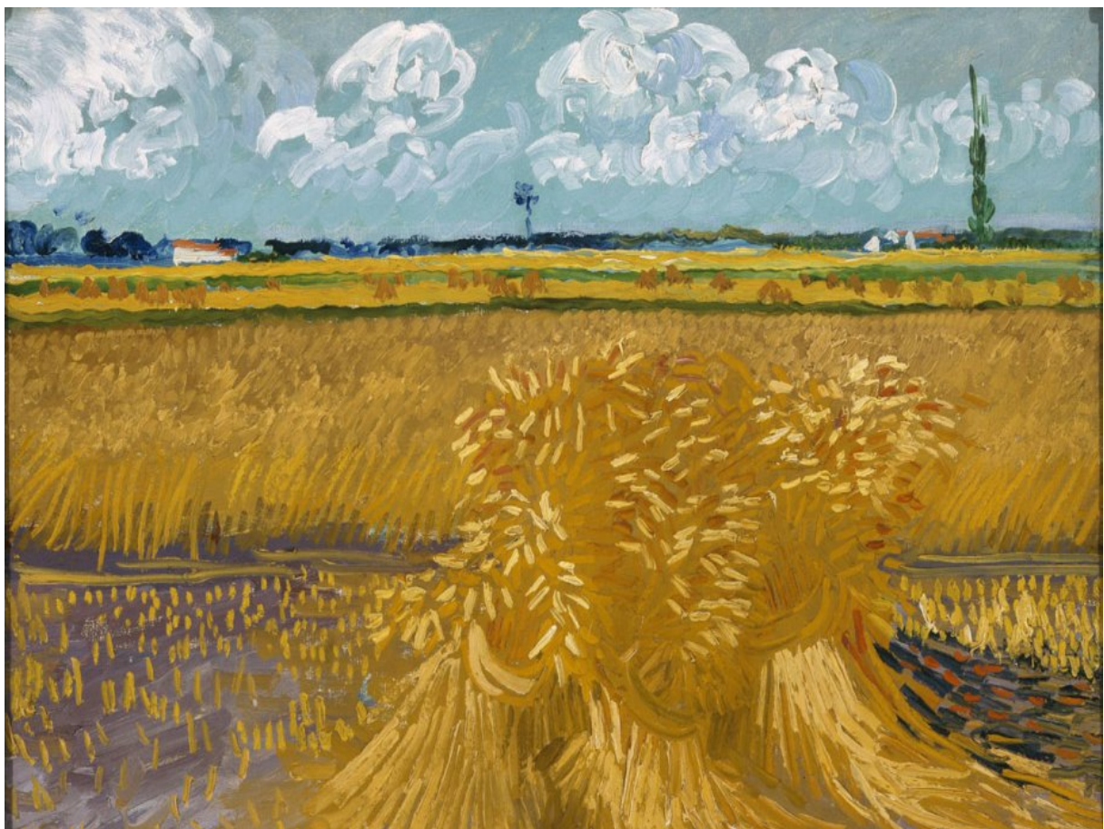
Champ de blé avec gerbes de Van Gogh