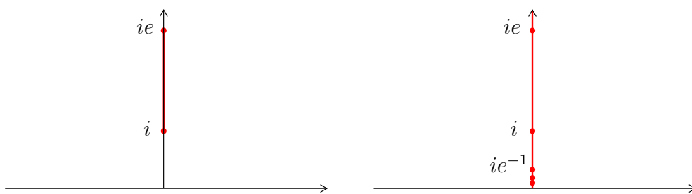
Figure 1.1: For G = \text{SL}(2, \mathbb{R}) and g = \begin{pmatrix} e^{\frac{1}{2}} & 0 \\ 0 & e^{-\frac{1}{2}} \end{pmatrix} , taking a geodesic arc from i to g \cdot i = ei and prolonging it gives the geodesic f(t) = ie^t .