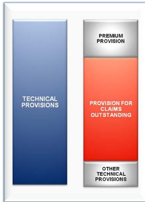
Figure 1.2: Technical Provisions in the Solvency I balance sheet