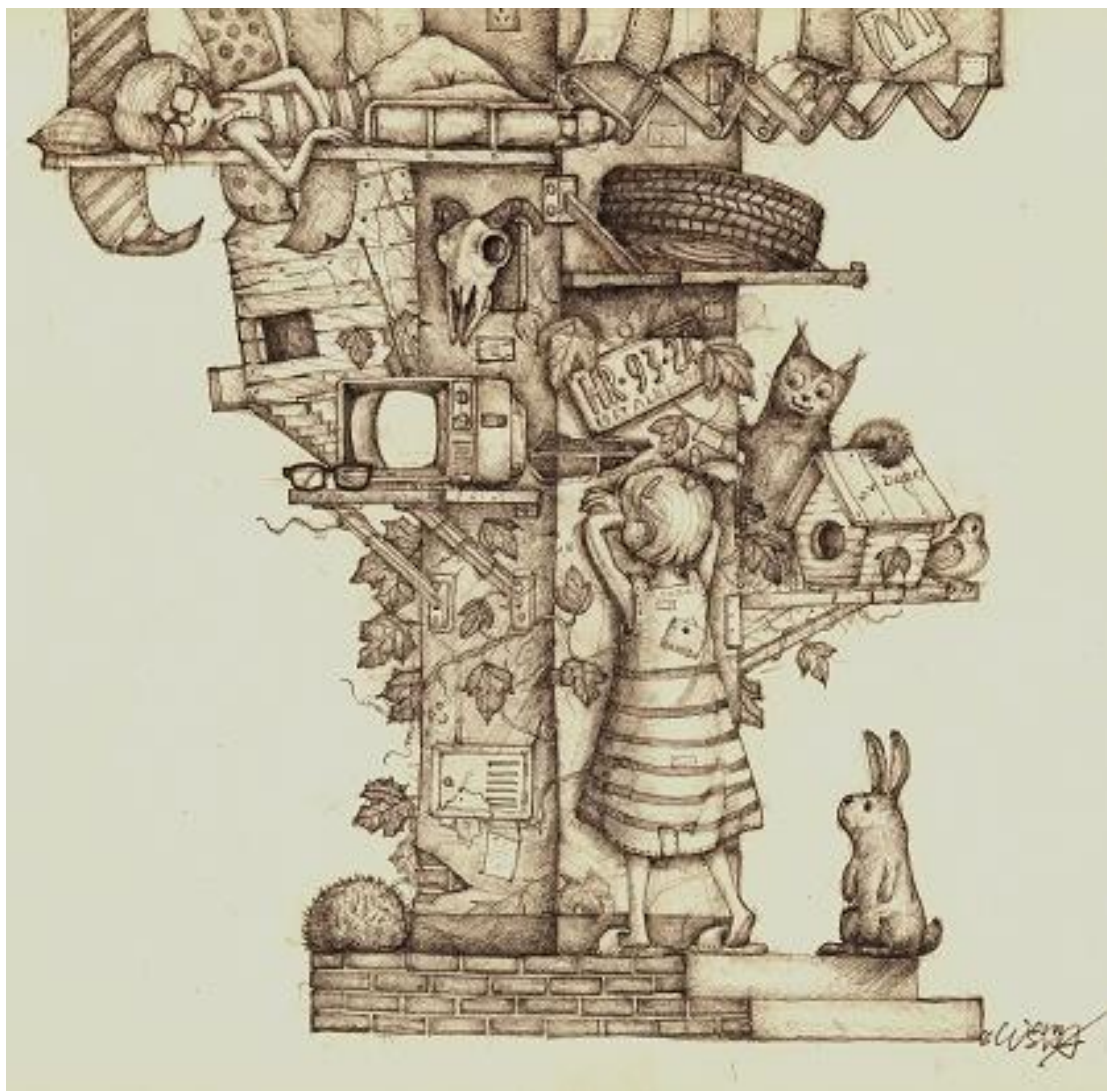
Illustration courtesy of James Wang