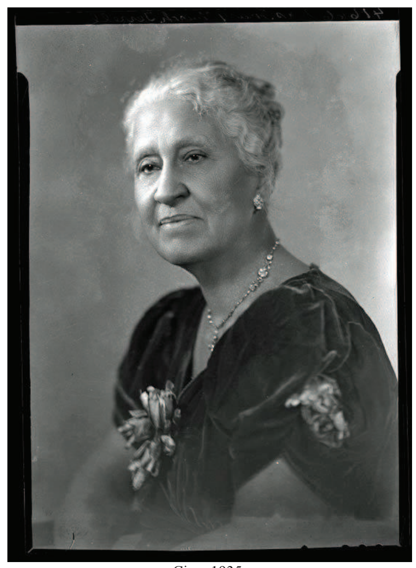
Circa 1935.