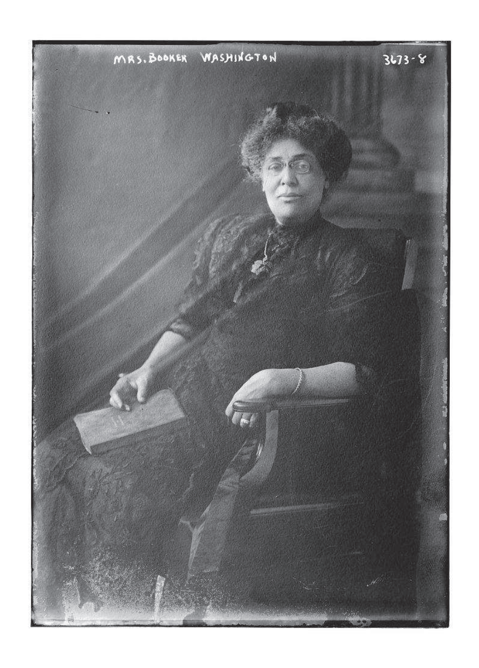
Circa 1915.