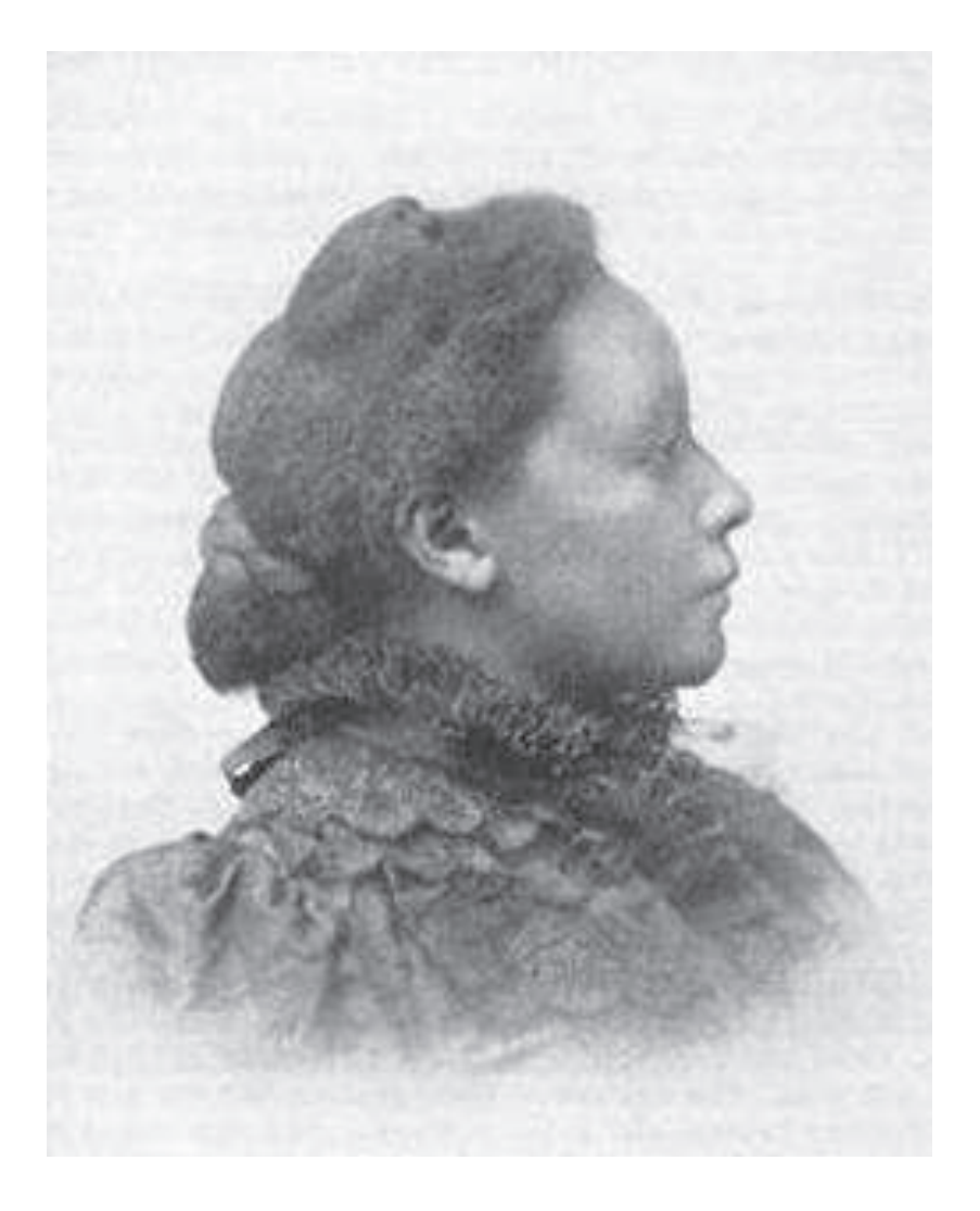
Circa 1902. Author unknown.