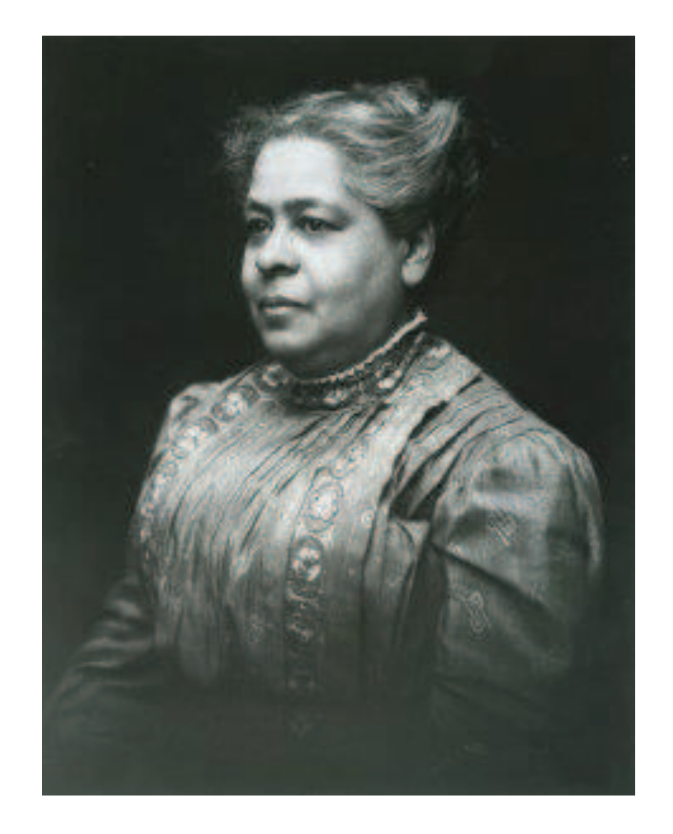
Circa 190. Public domain.