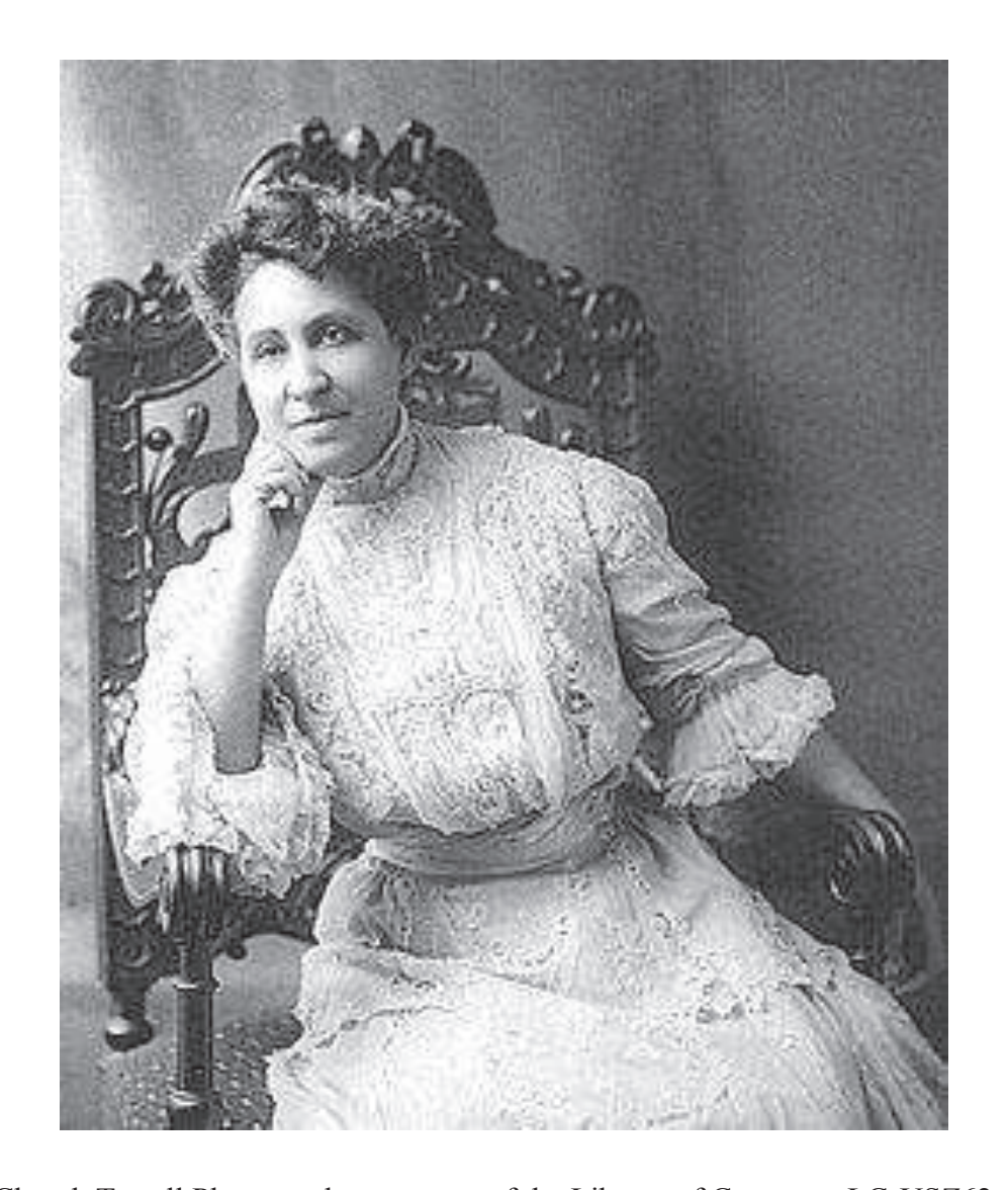
Mary Church Terrell Photographs, courtesy of the Library of Congress, LC-USZ62-54722.