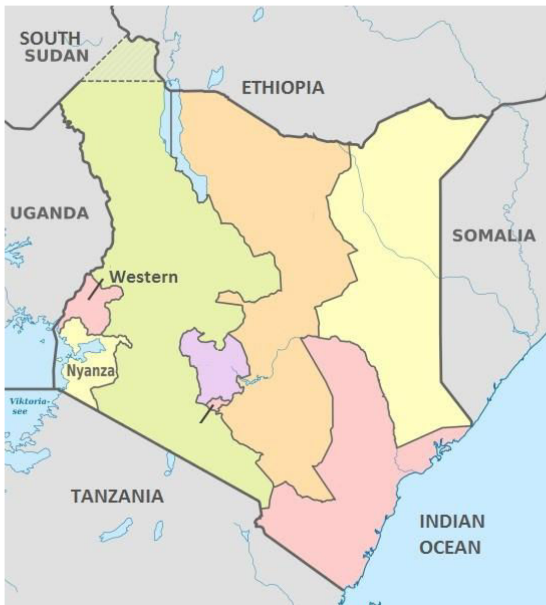
Figure 1 Map of Kenya Showing the Position of Nyanza and Western Province