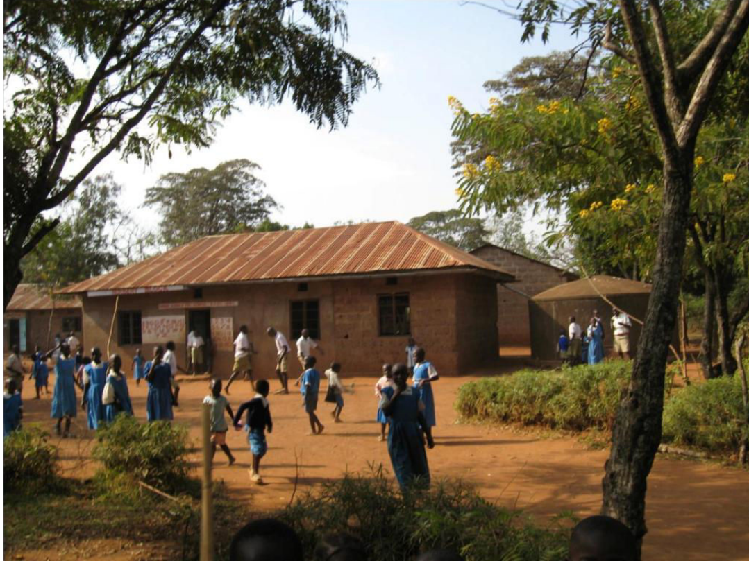
Figure 14: Showing pupils of Oseno Komolo Primary School