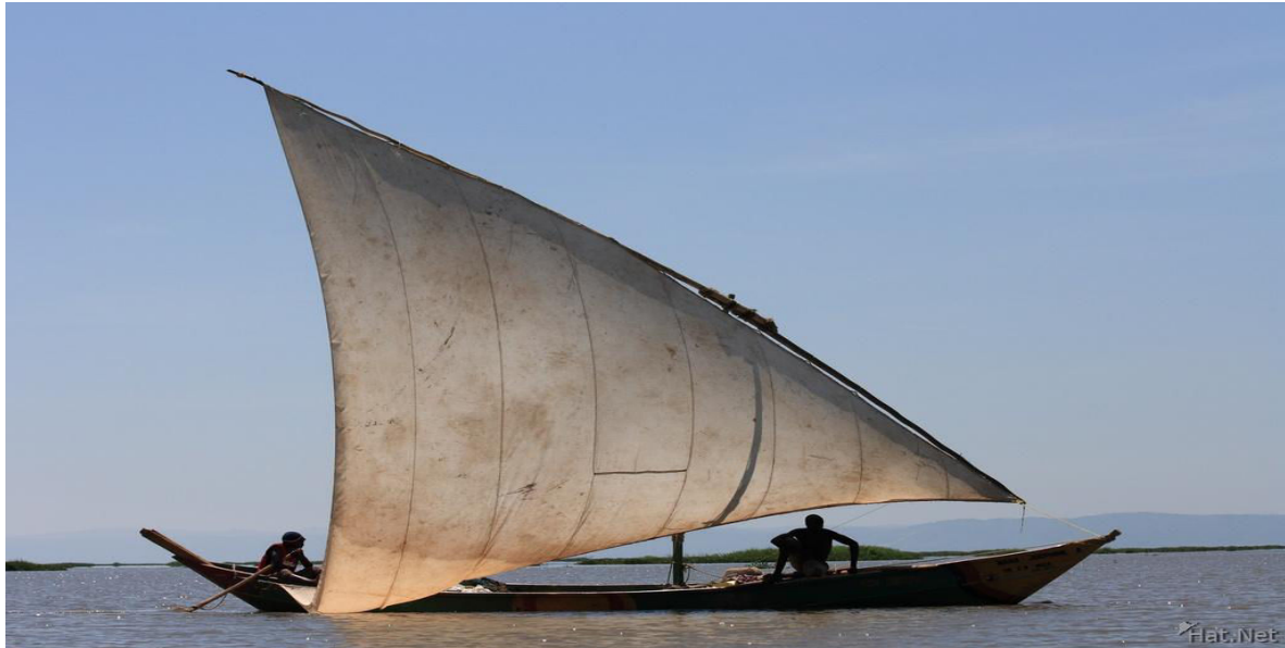
Figure 9: Showing A Dhow Used As A Mode of Transportation In Lake Victoria

East Africa, Lake Victoria