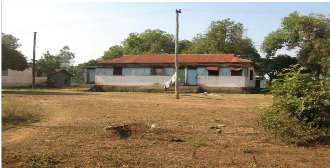
Figure 17: An architectural design of an Indian residential house in the village (Ndere)