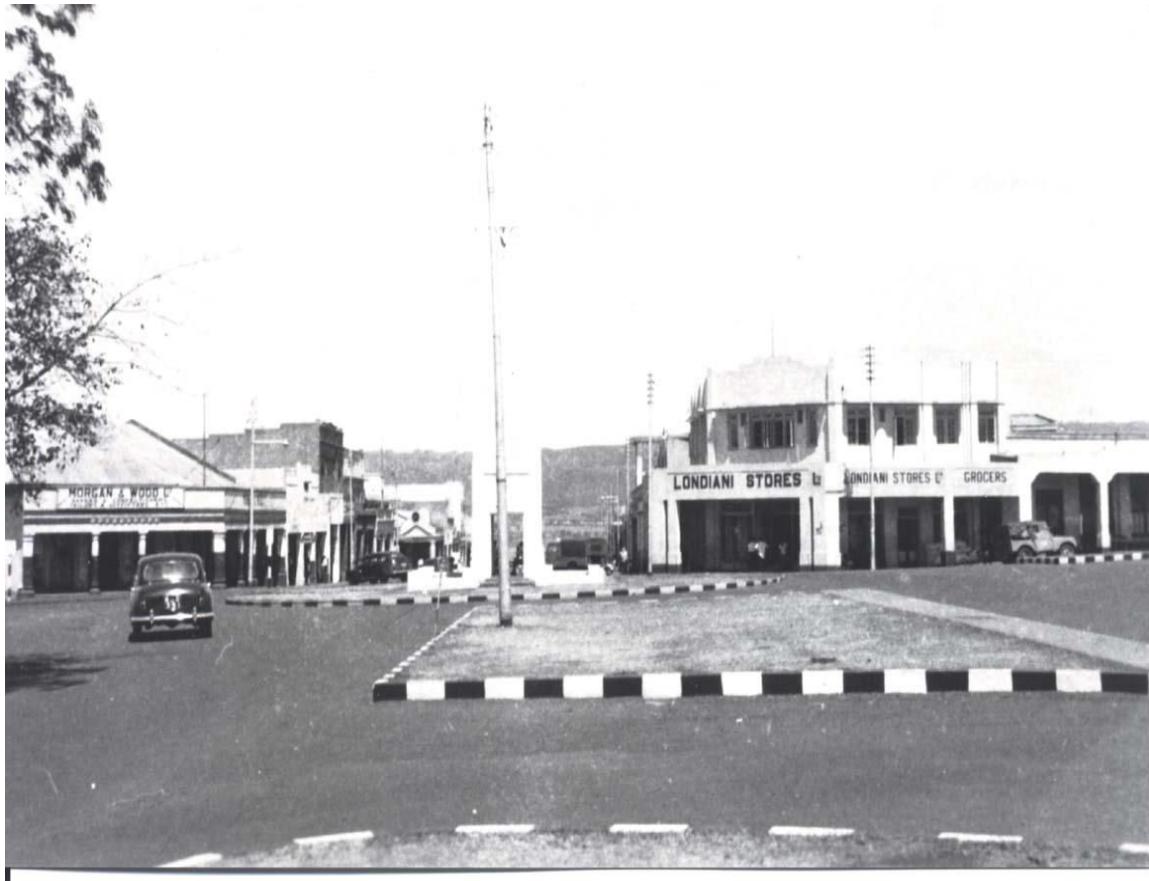
Figure 18: An Old Picture of Kisumu Town Showing Old Indian Shops with Their Residence