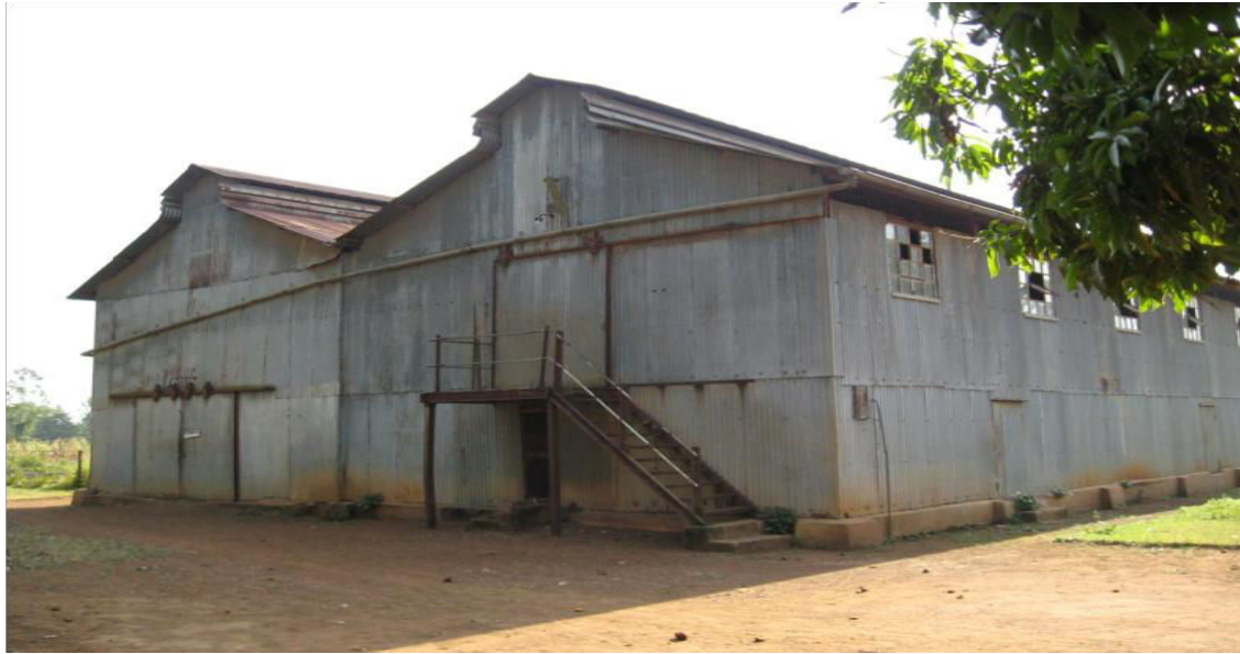
Figure 16: A picture of a stalled cotton ginnery in Kibos