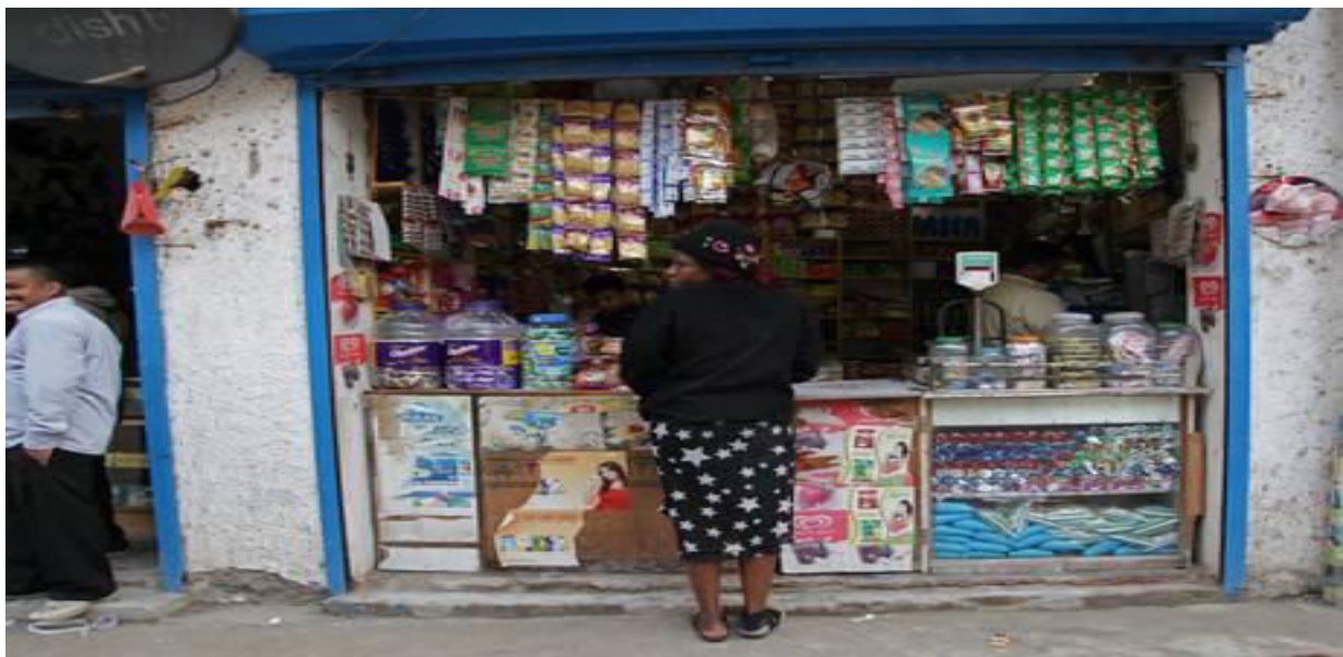
Figure 5: An African woman buying items from an Indian shop