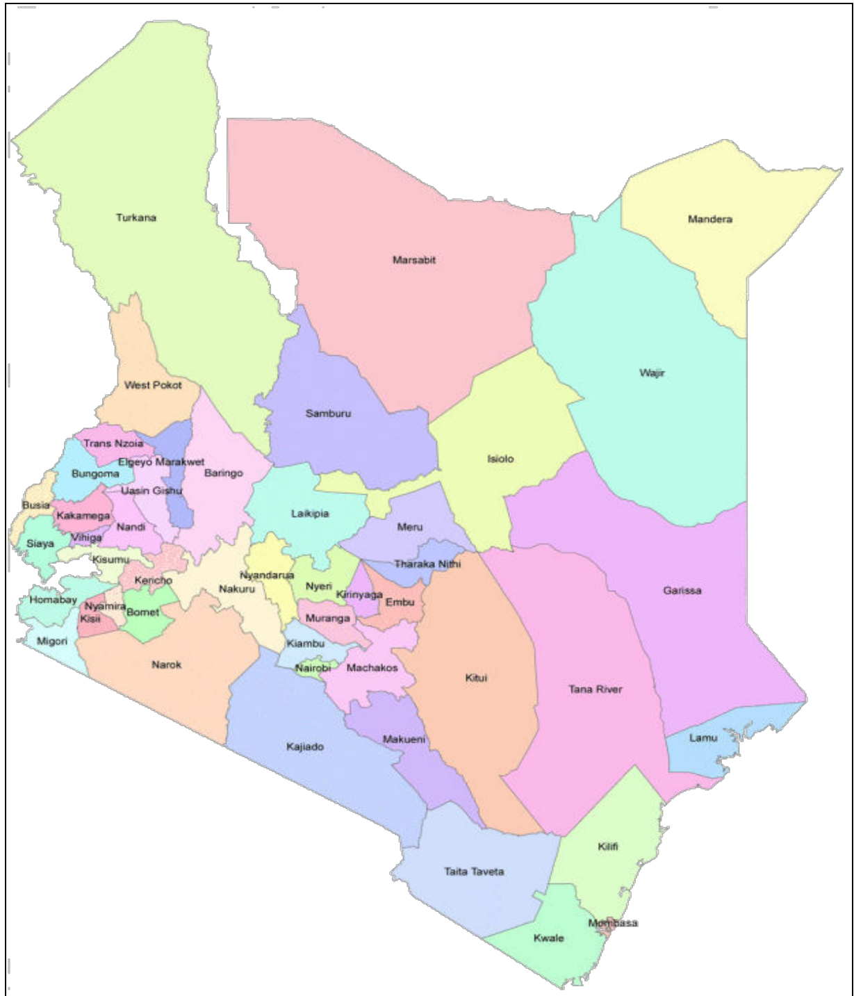
Figure 3: A Map Showing Administrative boundaries of Kisumu, Kakamega, Siaya and Bungoma