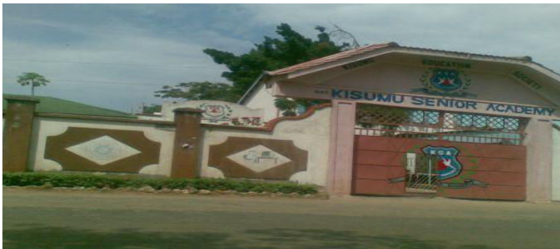
Figure 19: Entrance to the Kisumu Senior Academy owned by Indians but also admits Africans