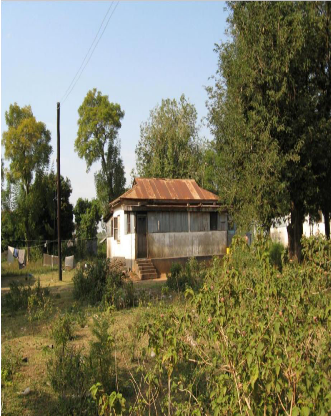
Figure 15: A picture of Asian residential houses in Ndere