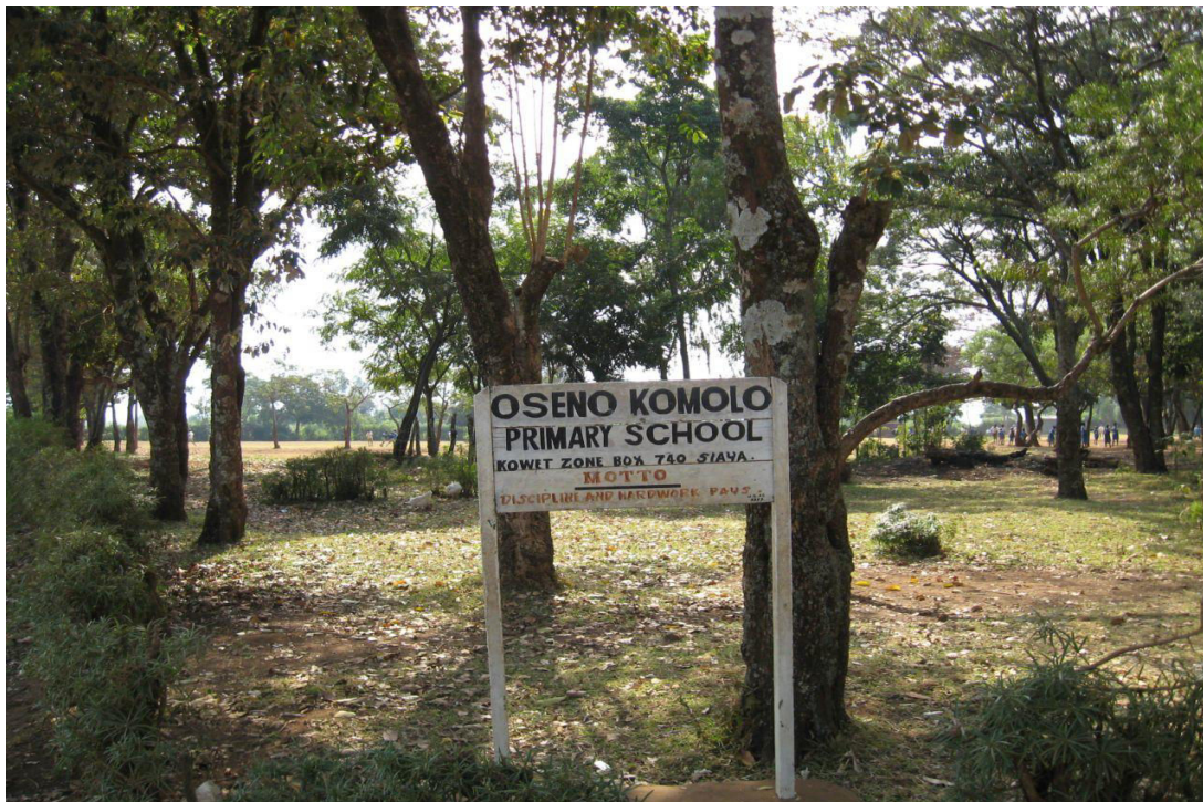
Figure 13: Showing the sign post of Oseno Komolo Primary School in Ndere