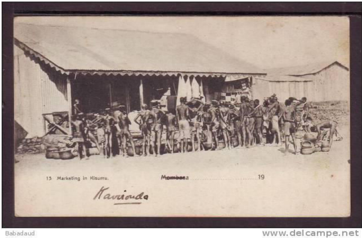
Figure 4b Africans gathering around an old Indian duka on a market day in Kisumu