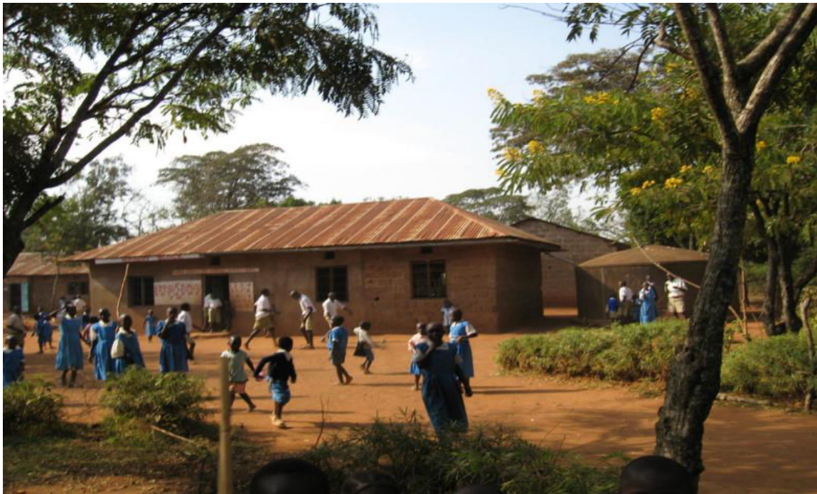
Figure 11: A Picture of a class formerly used by Indian Pupils at Ndere, Oseno Komolo Primary School