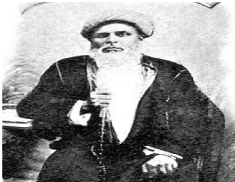
Figure 6: A picture of Allidina Vishram

We can follow the history of duka through biographies. For example, Allidina Visram, 23 an Indian Ismaili also opened up dukas (shops) in Kisumu and other posts well before the Uganda Railway was completed. The pattern of commerce adopted in the interior by Visram and the other Asian traders revolved largely around the exchange of an increasing variety of imported goods such as cloth, wire, glassware and lamps for local produce of every description (Mangat, 1976:475). Meanwhile, Allidina had also diversified his business interests to include oil mills at Kisumu obtaining oil from sesame and copra (Mangat, 1976:477). The distribution of Asians in Nyanza and Western provinces therefore followed a pattern, which involved identifying potential markets for their products thereby opening up the interior parts of the postcolony to the Western capital economy.