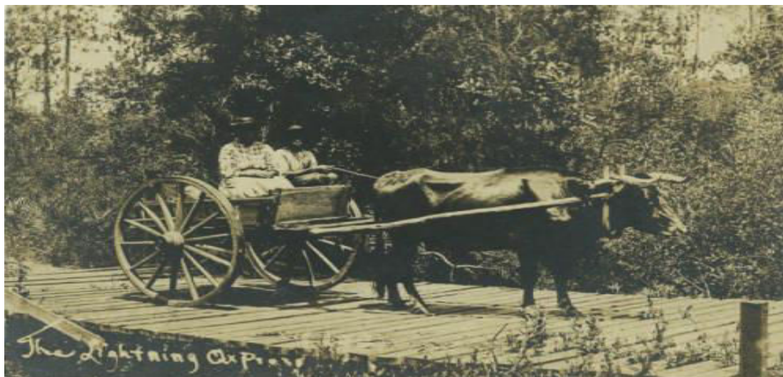
Figure 10: A Picture Of An Ox Drawn Cart

East Africa, Lake Victoria