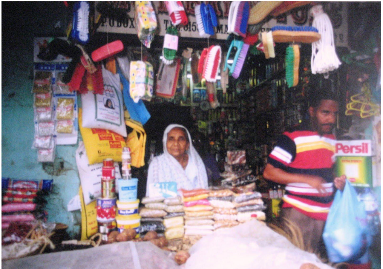
Figure 4: An Indian woman and man selling merchandise in a duka/shop