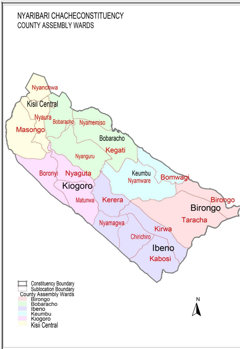
Figure 3: Nyaribari Chache Constituency County Assembly Wards