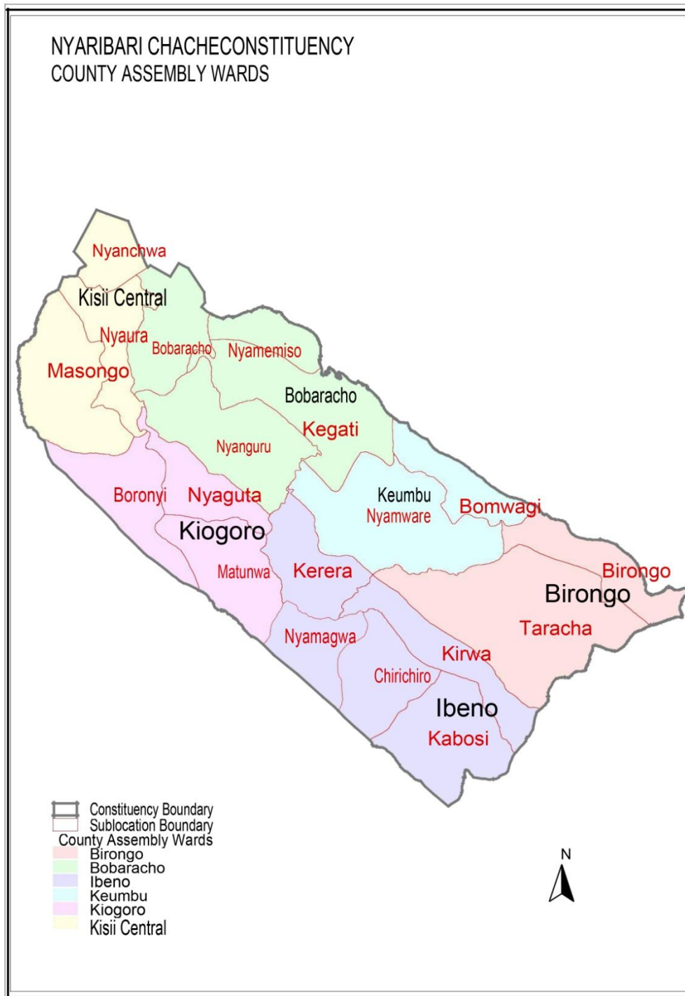
Figure 3: Nyaribari Chache Constituency County Assembly Wards