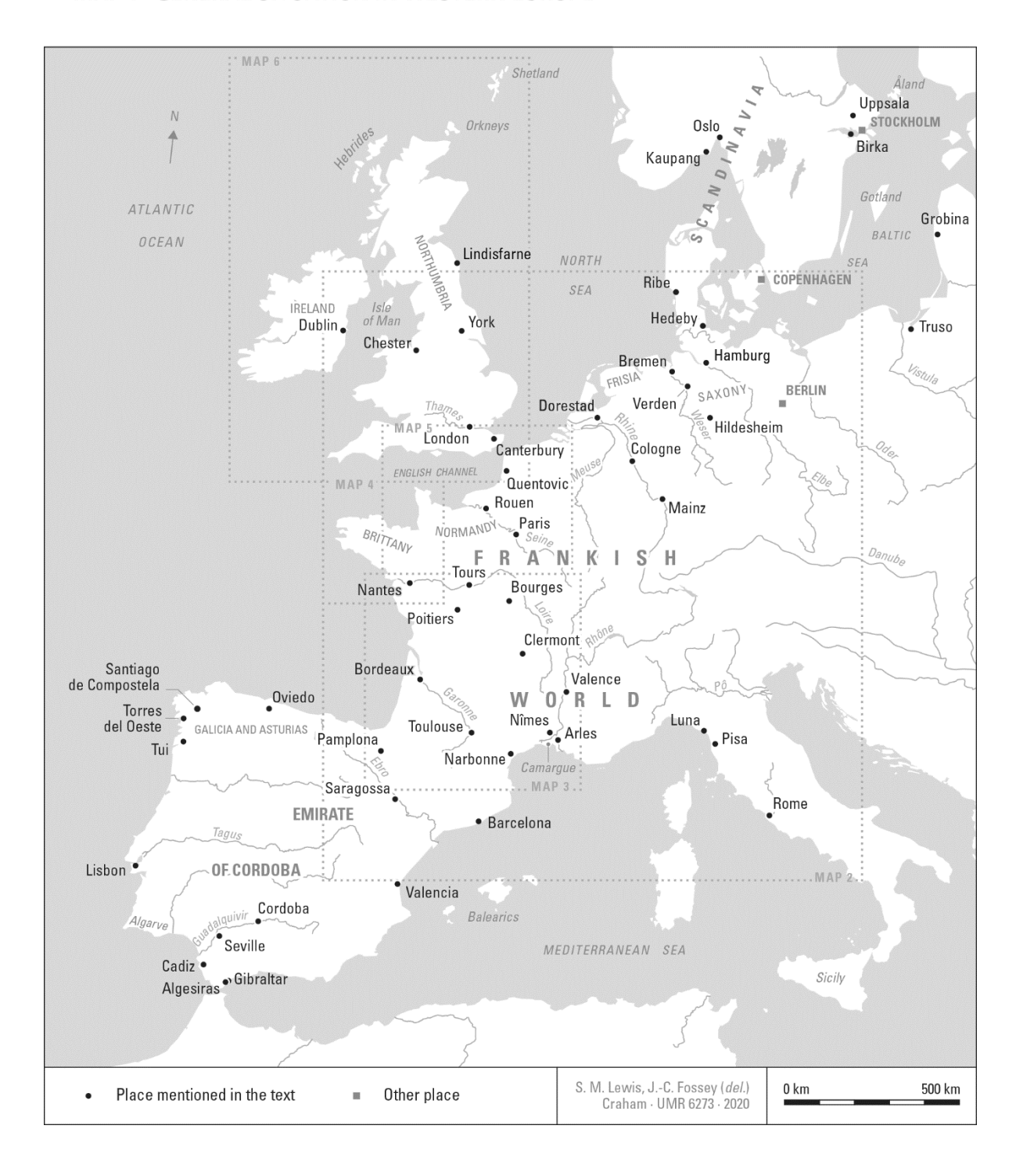
MAP 1 - GENERAL SITUATION IN WESTERN EUROPE