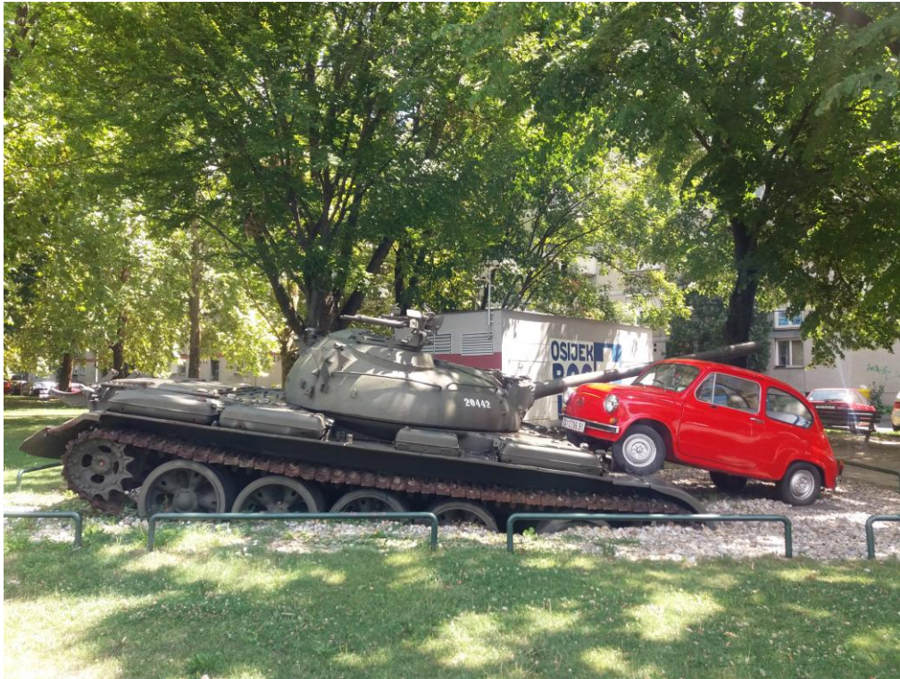
Figure 7.1 “Osijek 27 June 1991 – 27 June 2011. On June 27, 1991 the tank of the great Serbian aggressor crashed the red Fiat that was placed in defiance in front of it at this intersection by our fellow citizen Branko Breškić. In memory of resistance, defiance and victory in the imposed war, this art installation has been erected by the citizens of the unconquered town of Osijek” (the text explaining the monument, N.A.)