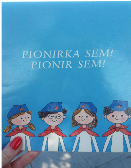
Figure 6.2 Pioneer schoolbook from Slovenia - memorabilia of an interviewee from Koper