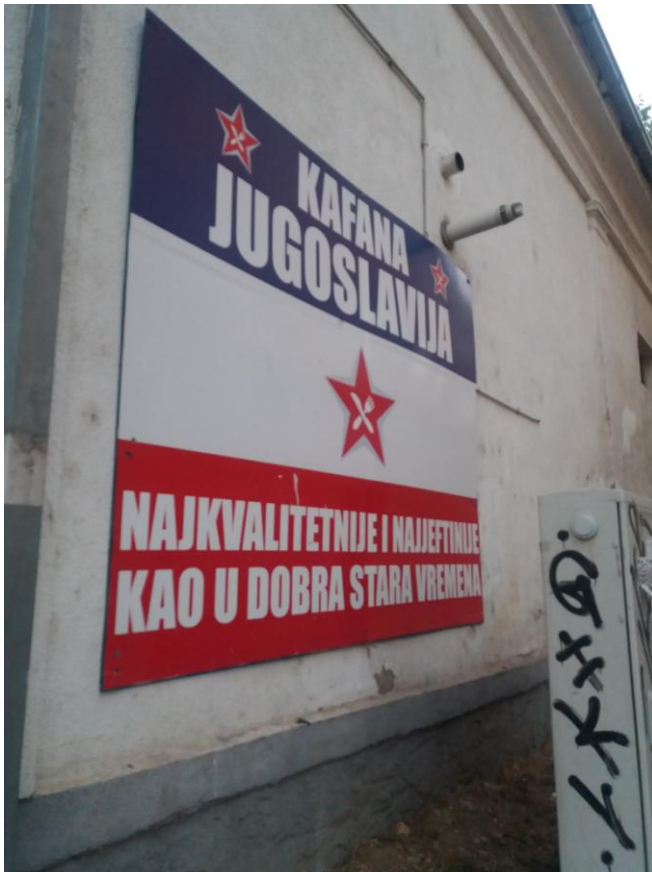
Figure 7.2 Kafana Jugoslavija in Kragujevac, Serbia – “the best quality and the cheapest, just like in the good old times”

of Parliament notices: “When you say you are a socialist [today], you don’t think now that people will laugh at you, it has become a legitimate political position” (6-SLO-1983-M). They criticize the notion of Yugonostalgia as presented in the media and the public space, identifying it as banal emotion based on commodified goods, as an activist explains: “In one sense, you see a bunch of Slovenes go to Belgrade for New Year’s Eve and there they buy nostalgia... and then, those Slovenes come back to Slovenia and say that Yugoslavia is communism, totalitarianism, everything that was happening after WWII, killing everyone” (22s-SLO-1978-M). The multiplicity of content of the term of Yugonostalgia as we know and use it today here clearly obfuscates the ideological debates and struggles in the present times; behind the tourist industry, there is more at play (see Figure 7.2).