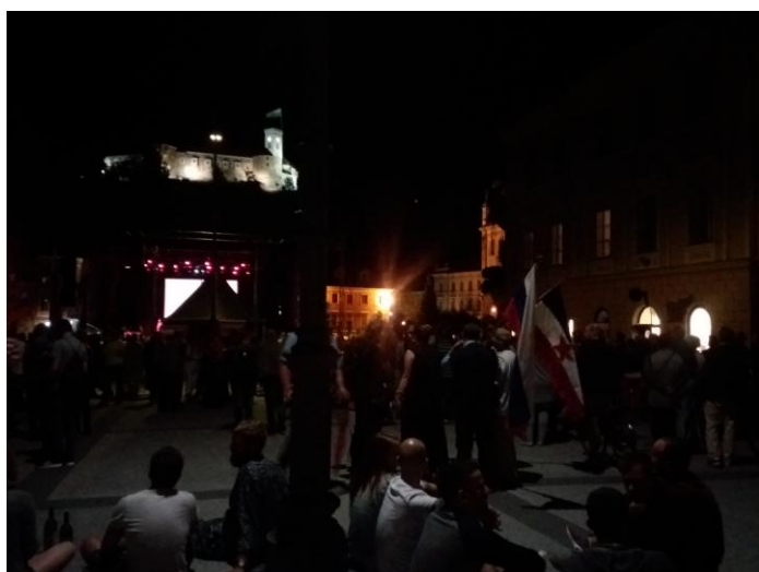
Figure 8.3 Nosil bom rdečo zvezdo concert, where a number of participants brought Yugoslav flags, Ljubljana, 2018

Meaning making processes of the last pioneers thus are burdened with contradictions between, what they perceive, personal and public memory narratives leaving them with a number of open questions and cognitive dissonances – creating the previously noted ambivalence. As Yugonostalgia can soothe the dissonances, providing a space where it is not imperative to have a clarified political understanding; the political potential of (post)Yugoslav memory narratives of the last pioneers proves to be more challenging.