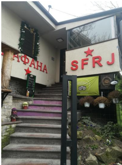
Figure 8.1 Kafana SFRJ in Belgrade