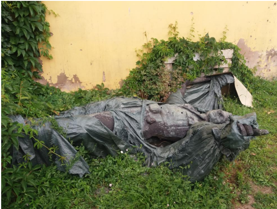
Figure 7.3 Demolished Partisan monument in Osijek, laying abandoned in a courtyard

shows a more violent ideological struggle, as Reinhardt Koselleck explains: “we tear down the monuments when we see them as a threat or when we wish to suppress a still living tradition” (Koselleck, 2002, p. 325).