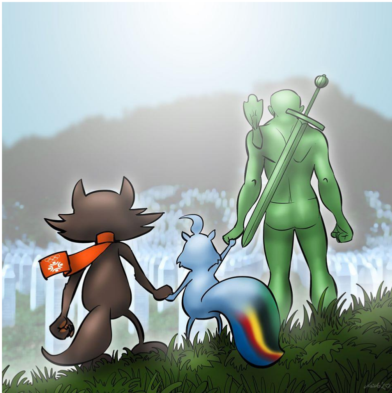
Figure 8.5 Midhat Kapetanović, July 2020