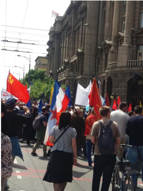
Figure 8.2 The 1 st of May protest organized by various trade unions and movements in Serbia where some of the participants brought Yugoslav flags, 2017

depicting it as a banal and a retrograde, or simply a useless, phenomenon; an emotion of the old generations mourning the old ways without a clear political agenda (See Figure 8.2).