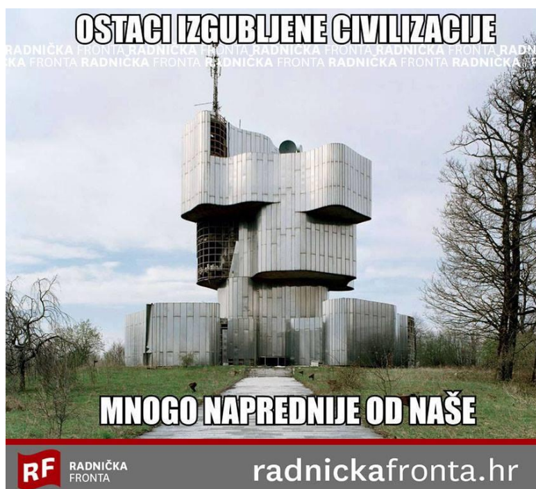
Figure 8.4 Radnička front Facebook page “Leftovers of a lost civilization much more advanced than ours” – on the photo is the Monument on Petrova Gora (Kordun, Croatia) by Vojin Bakić, erected during the socialist Yugoslavia, that has been seriously damaged in the 1990s and never reconstructed