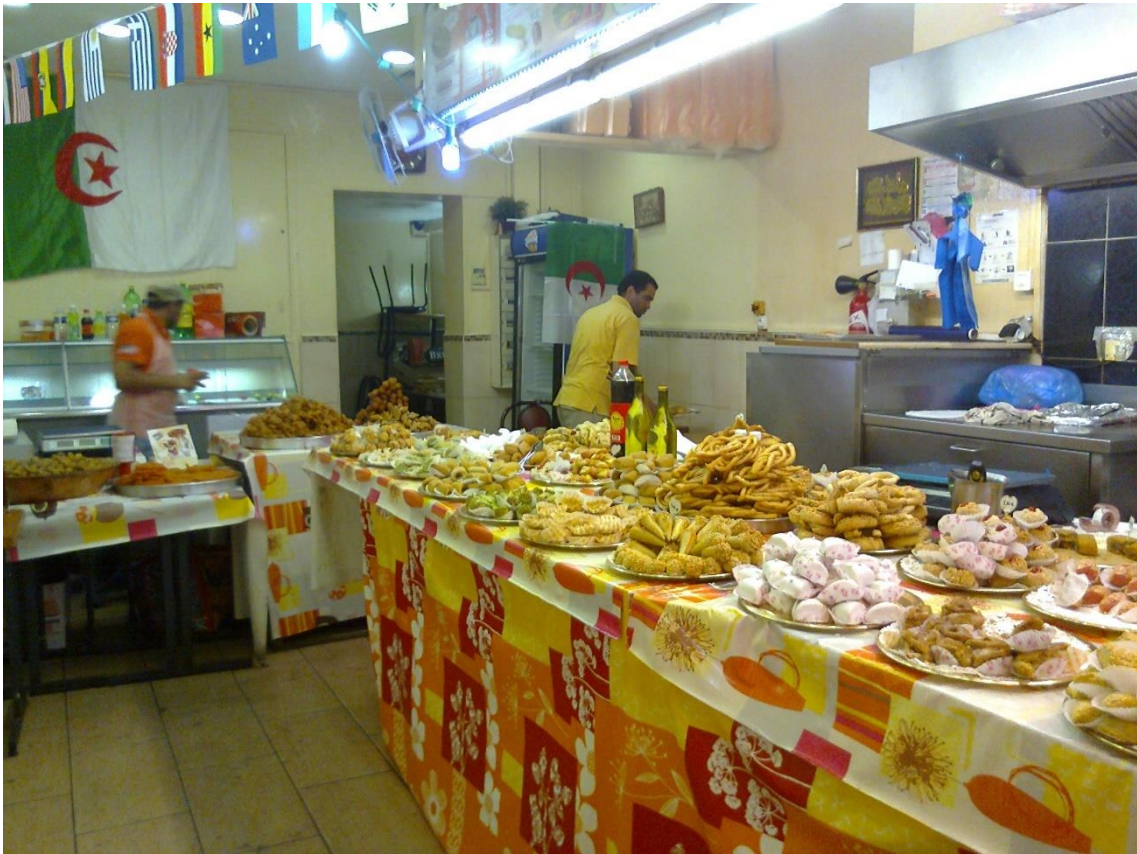
Picture 1.1 – Store selling Arabic desserts during Ramadan, Goutte d’Or