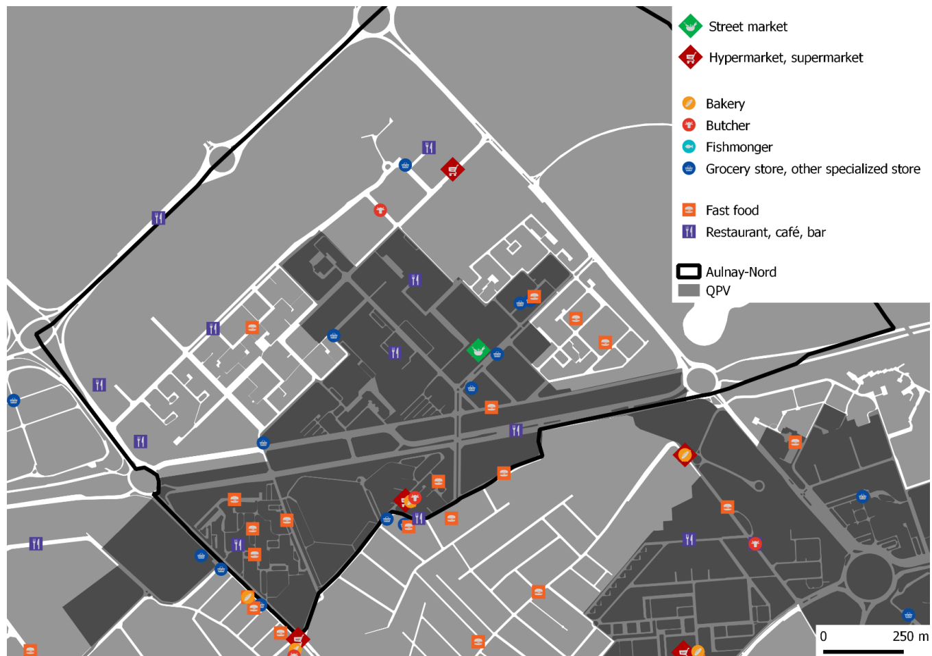
Map 2.3 – Retail food environment of Aulnay-Nord