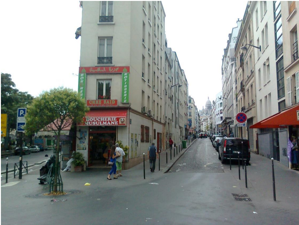
Pictures 3.1 and 3.2 – Street views of Aulnay-Nord (top) and Goutte d’Or (bottom)