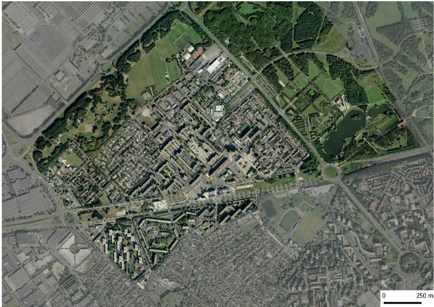
Map 3.1 – Aerial view of Aulnay-Nord.