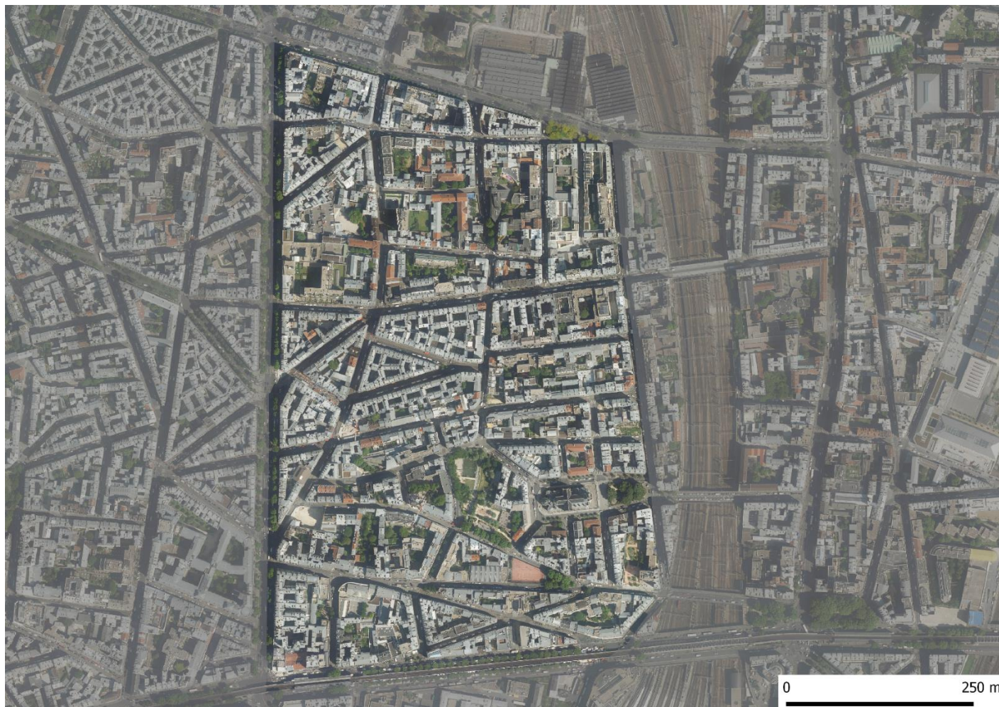
Map 3.2 – Aerial view of Goutte d'Or. Sources: CGET – QPV, 2018 (Open Licence) / Data Île-de-France – ZUS, ZRU et ZFU, 2014 (ODbL) / IGN – BD ORTHO® HR, 2018 (Licence Recherche et Enseignement Sciences Po). Cartography: the author, using QGIS (QGIS Development Team 2020)