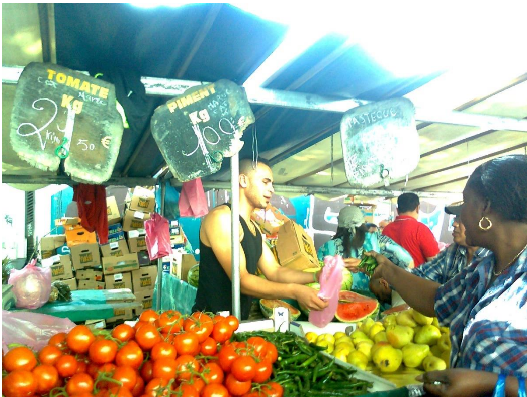
Pictures 2.1 and 2.2 – Stalls and sales at the Barbès market