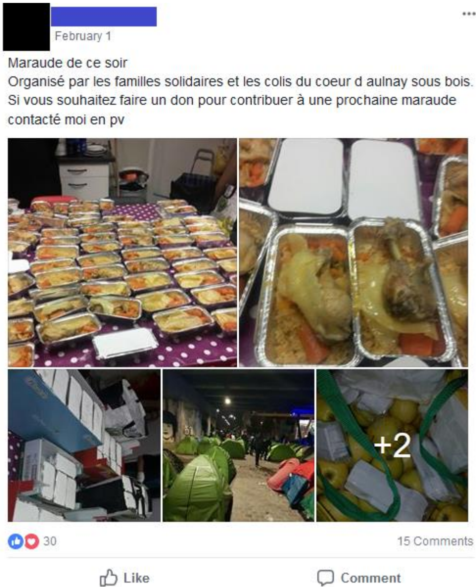
Picture 3.4 – Announcement in the Facebook group Seuls Les Aulnaysiens Peuvent Comprendre (“Only Aulnaysians Can Understand”) “This evening’s maraude Organized by the Familles Solidaires (“United Families”) and Les Colis du Cœur d’Aulnay-sous-Bois (“The Parcels of Love of Aulnay-sous-Bois”) If you wish to make a donation to contribute to an upcoming maraude contact me privately”