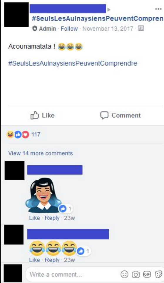
Picture 3.3 – Meme in the Facebook group Seuls Les Aulnaysiens Peuvent Comprendre (“Only Aulnaysians Can Understand”) “Look Simba, all that is in the light, it’s France! It’s beautiful!” “Whaaa!” “But what is that thing in the shadow over there?” “Over there is Aulnay-sous-Bois, you should never go there!”