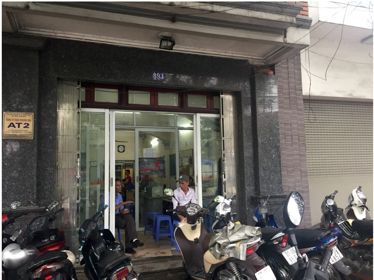
Picture 1. DRIVE research site — Friendship's Arms' Office — from the outside. Two peer outreach workers were watching vehicles. The reception desk was right behind them.