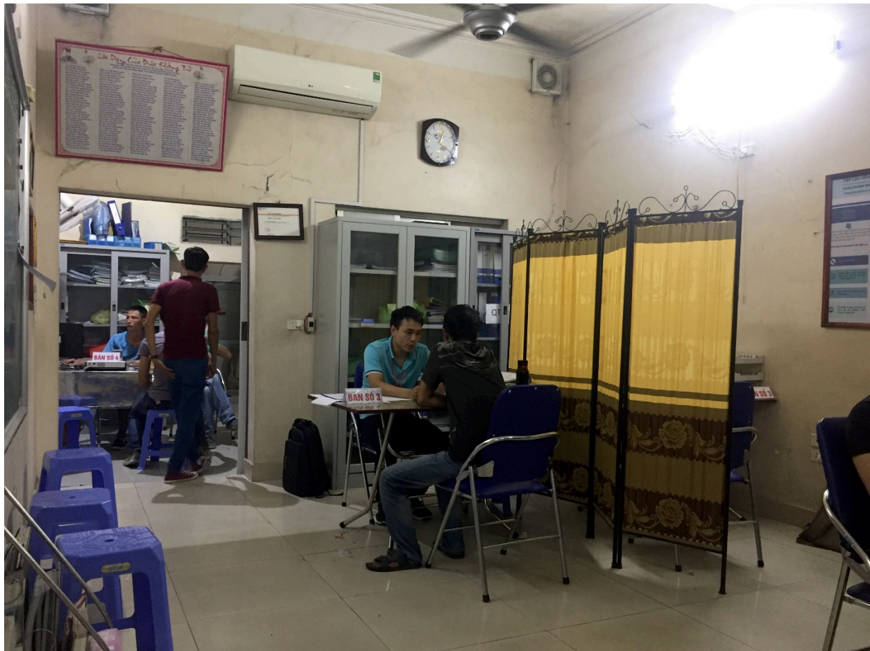
Picture 3. Desk 3 (in front) — explanation of the informed consent by a staff. Desk 4 (in the back) — checking injection marks and urinalysis by peer workers.

After this period, we came back to Haiphong from September throughout December 2018, mostly to do interviews. This time, we worked at the SCDI office as the rooms at the DRIVE research sites were busy. Thus, we were able to better understand how SCDI staffs worked as the focal point among peer outreach workers, participants, Haiphong PAC and the legal system. Below is a part of our notes taken from our conversation with Thanh, the SCDI regional coordinator over our morning coffee.