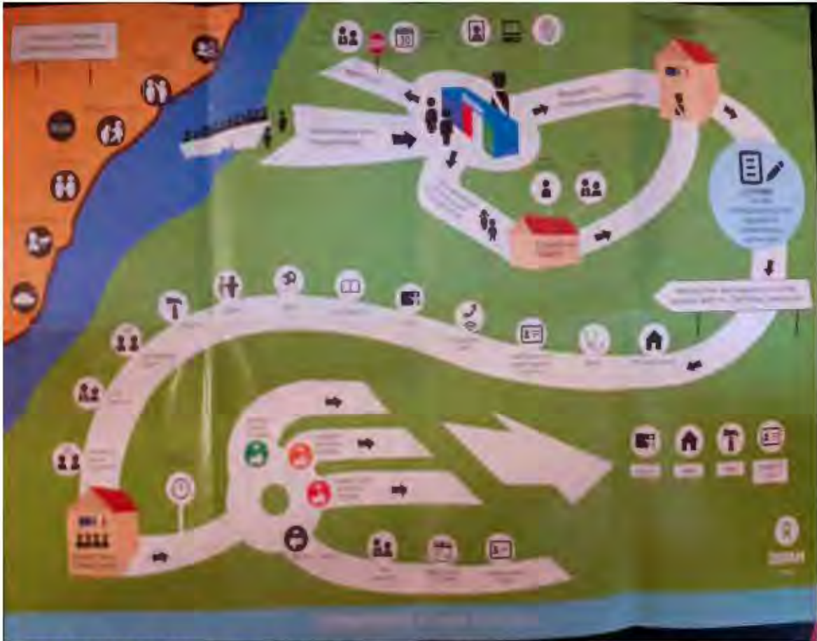
Figure 4. Part of the Leaflet OpenEurope - Guide to rights.

application (and its possible outcomes) and the other provided a list of useful services and contacts of national and local TSOs.