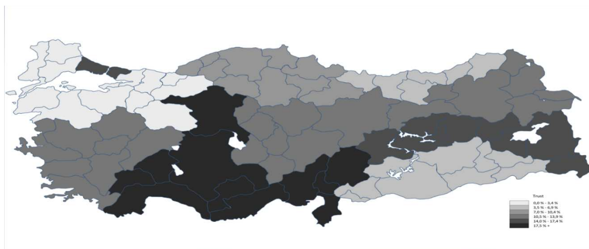
Figure 1. 3 Generalized trust between regions in Turkey, 2012.

Note: The darker the shade is, the stronger generalized trust is. Source of data: World Values Survey