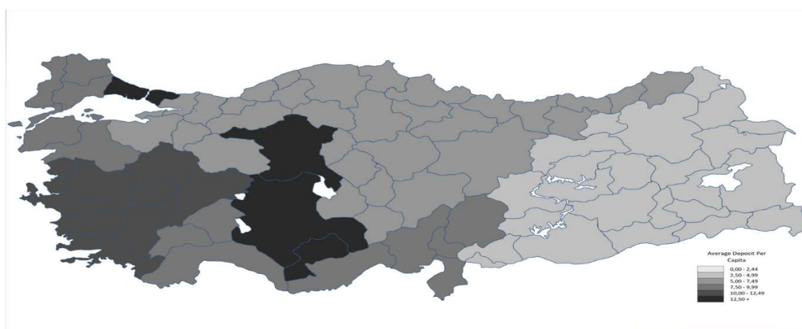
Figure 1. 4 Average level of financial development between regions in Turkey, 2011-2017.

Note: The darker the shade is, the higher the level of financial development is. Source of data: The Banks Association of Turkey