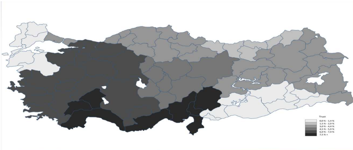
Figure 1. 1 Generalized trust across regions in Turkey, 2007.

Note: The darker the shade is, the stronger generalized trust is.