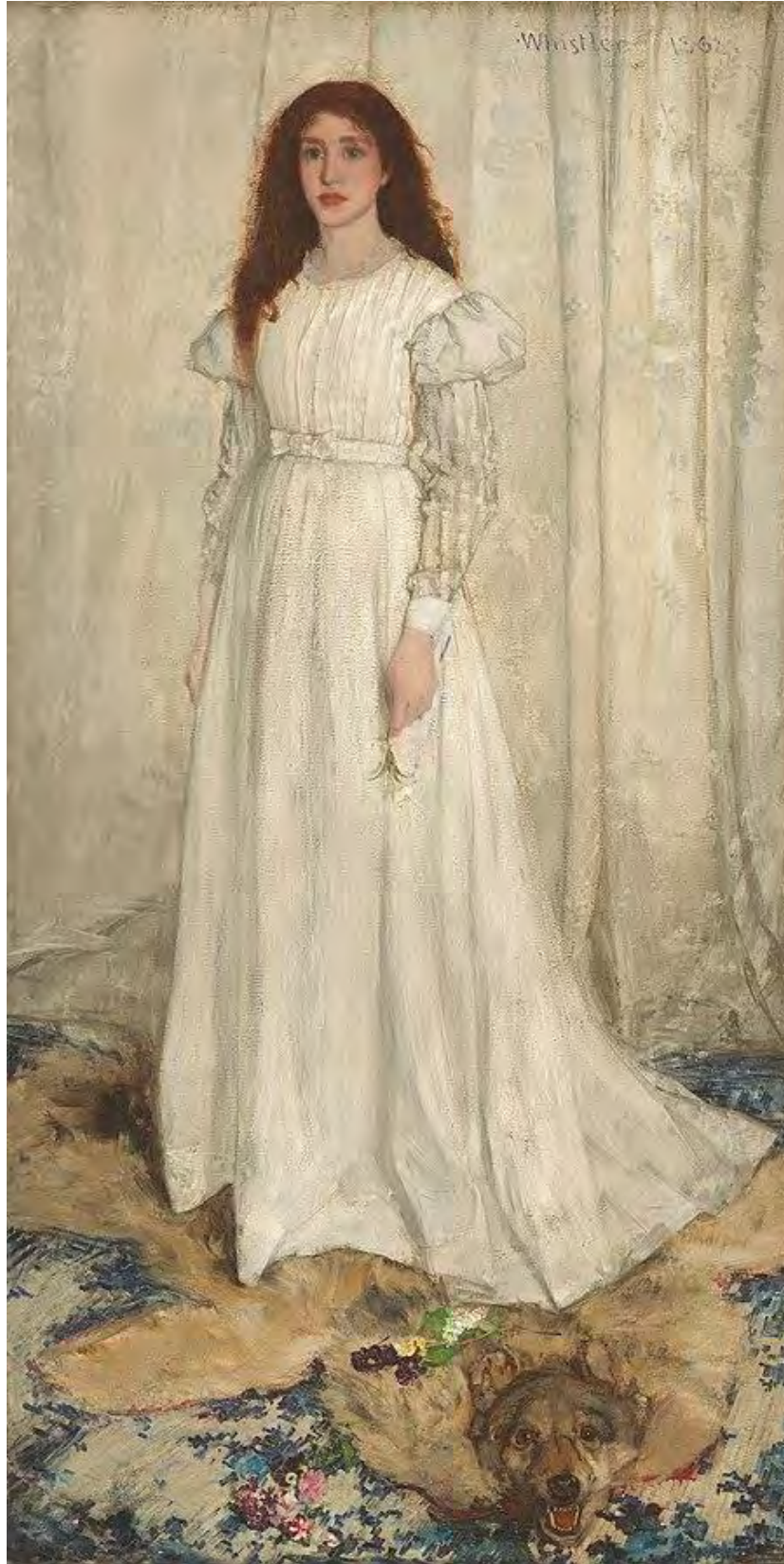
Figure 1: James Whistler, Symphony in White no 1 (The White Girl) , (1862)

Just like poor and mad Anne Catherick in Collins and Joanna Hiffernan, the long-time muse, model, and mistress of James Whistler, we find Sarah in Fowles's novel, Agnes and Sugar in