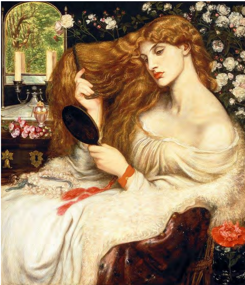
Figure 3: Dante Gabriel Rossetti, Lady Lilith (1866-1868)

as she exclaims: “I’ve lived with the family forty-nine year come Michaelmas, and I’ll not see it disgraced by any one’s fine long curls. Sit down and let me snip off your hair, and let me see you sham decently in a widow’s cap to-morrow, or I’ll leave the house” (Gaskell 1853: chap. 13). Similarly, Pre-Raphaelite paintings of the time manifestly celebrate women’s hair. Dante Gabriel Rossetti’s Lady Lilith (1866/1868) for example highlights the auburn hair with long, thick and wanton tresses. Ultimately, such hair became strictly associated with the fallen woman whose moral corruption is epitomised through her unregulated hair.