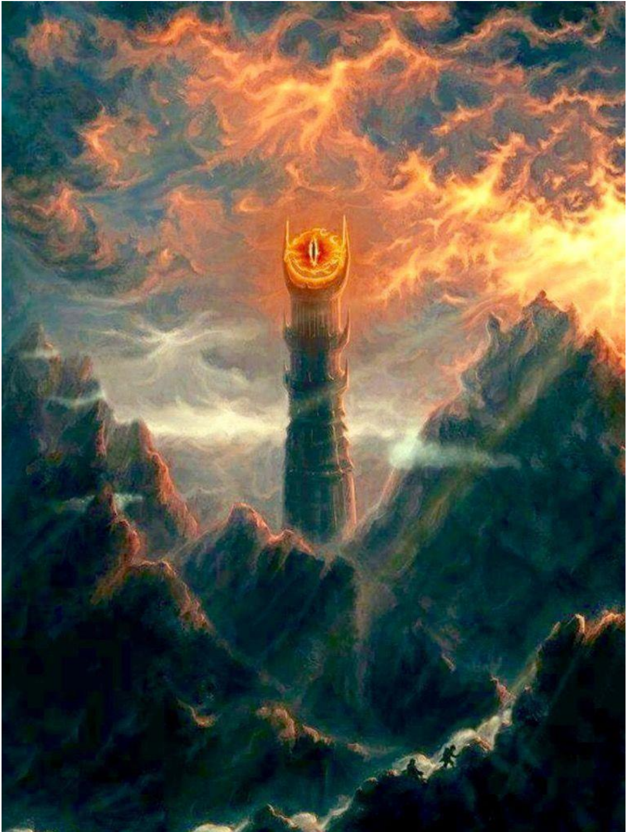
The Eye of Sauron -Lord of the Rings-