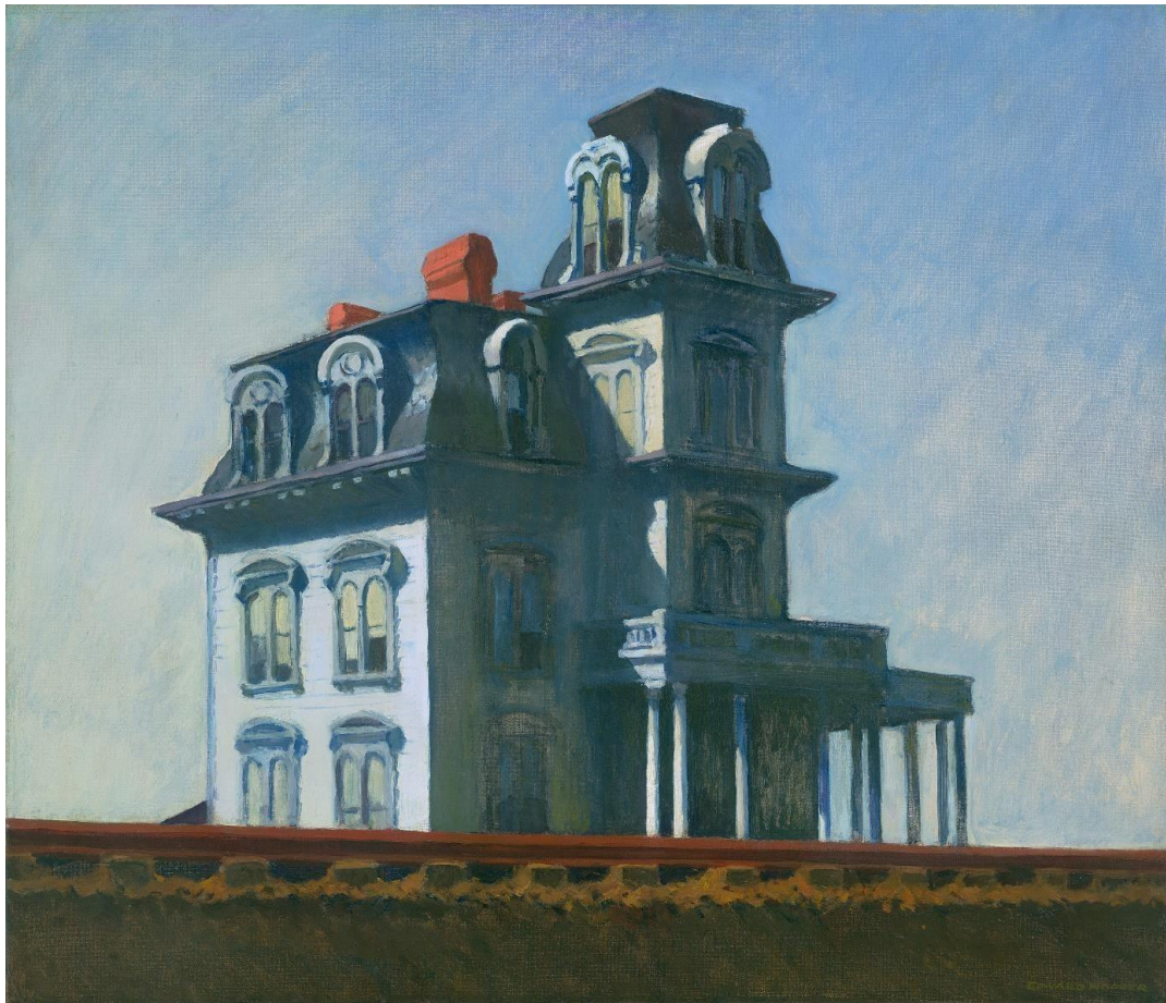
Edward Hopper's House by the Railroad (1925)

Within this context of a stressful urban daily life, having a summer house for a vacation was their only haven. Thinking that they find a bargain, the Rolfes visited the Long Island House, a summer mansion that apparently is the perfect concretization of what Marian dreams of. The Long Island house is firstly depicted as a massive, gloomy house in the middle of nowhere. It is perfectly situated in an isolated area with “no sign, no break on either side of the road” (Marasco 21). This initial description echoes the iconic painting of the American artist Edward Hopper House by the Railroad (1925) 89 as it conveys complete alienation from modern life.