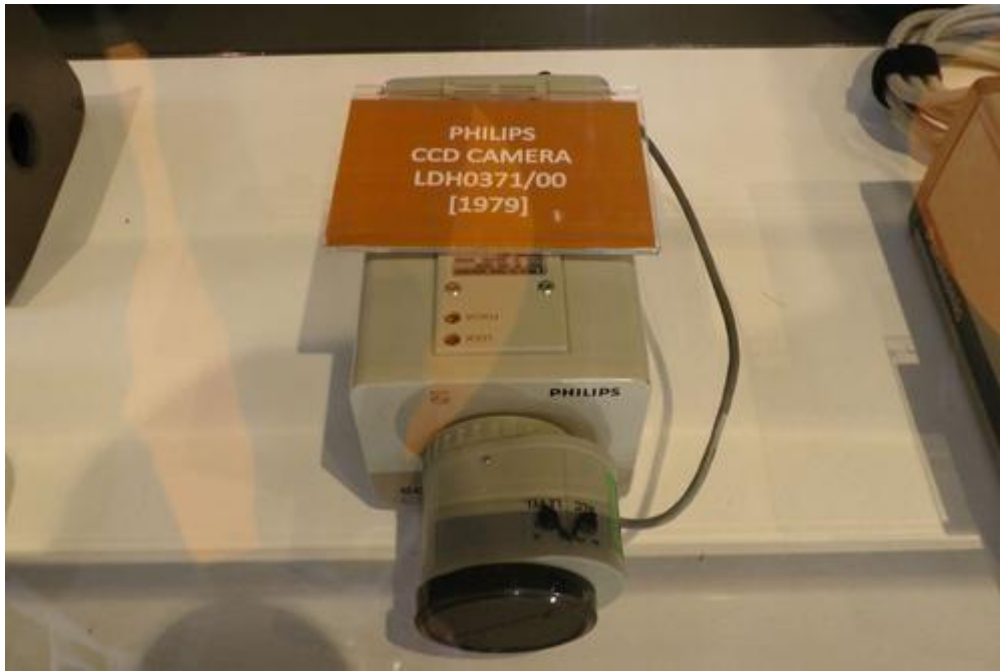
Fig.3. Philips CCD Camera (1979)

Peterson examines further the brisk development of surveillance technologies, giving the example of what is called ‘blue boxes’ that controlled payphones. It is a technology that allows the manipulation and the surveillance of different conversations (150). Surveillance becomes electronic more than ever before. With the unceasing development of technology, the illusion of privacy was wiped out as citizens have become aware of the rising totalitarian state that they live in (especially after the Watergate scandal). The established surveillance government inspires the world of art in the twentieth century as numerous works of art (movies, music and literature) dealt with the relationship between technology and surveillance, reflecting the public anxieties of the era.