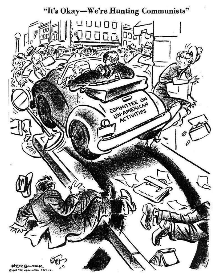
Fig.2. "It's Okay-We're Hunting Communists." Washington Post , 1947.

authors and cartoonists. One of the most famous artists who denounced the exaggerated governmental practices is the cartoonist Herbert Lawrence Block (known as Herblock). He was known to be a fierce opponent of Senator McCarthy's oppressive methods that created a ubiquitous sense of fear and alert. Throughout his numerous works, Herblock criticized the American domestic policy that deprived Americans from their civil liberties and freedom of choice and expression. His 1947 cartoon entitled "It's Okay -We're Hunting Communists" is a good illustration: