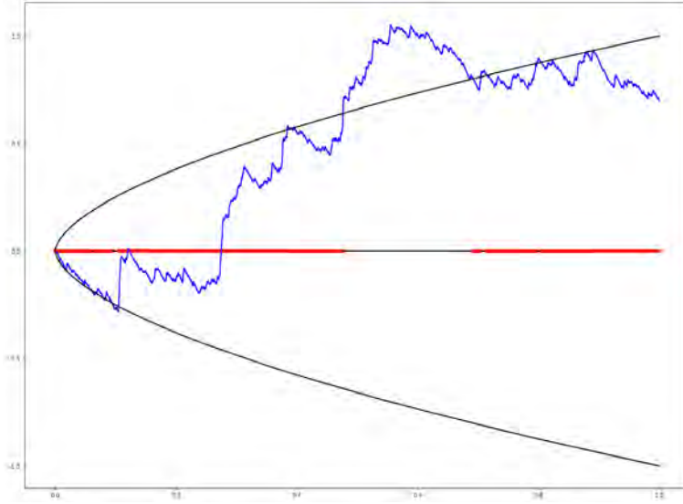
Figure III.1: Simulation of a Rosenblatt process of Hurst index H = 0.6 . In red - the sojourn set E_Z(\gamma) for \gamma = 0.6 .

where E \subset \mathbb{R}_+ and E' \subset \mathbb{R} are Borel sets. These sets, due to self-similarity property of Z , may look like a fractal, see, e.g., Figure III.1, for the sojourn set of the Rosenblatt process. In order to describe such sets quantitatively one can use a type of fractal dimension.