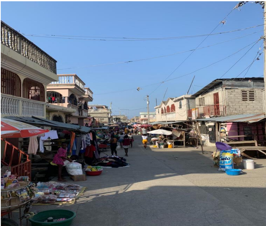
Photo of a neighborhood where I conducted my fieldwork in Northern Haiti in 2021.

The chita bay blag sessions allowed them to re-strategize as a group and determine how to respond to specific situations, especially in the face of discrimination due to their gender and sexual orientation. Occasionally, these sessions became heated when one friend made a pass to another friend's intimate partner or boyfriend or if they suspected that their partner was cheating on them with someone they knew, such as a close friend who may belong to the same network. While these sessions provided them with an opportunity to gather and chat about their collective conditions as gay men in Northern Haiti's context, they could also be spaces of tension and mistrust because of the threat of losing one's boyfriend to someone close. As I discuss in chapter five on the meanings of gay migrant remittances in these intimate transnational relationships, losing a migrant boyfriend can be costly to some gay men in Northern Haiti. Therefore, they navigated these friendship networks cautiously while finding comfort and happiness in hanging out with their gay friends.