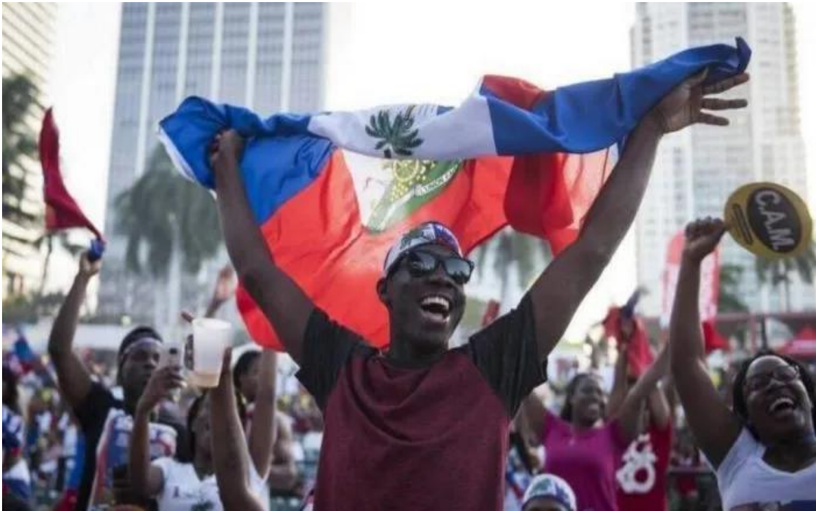
© Copyright: Haitian Times. A Haitian migrant celebrating the Haitian Kompa Music Festival in Miami. Photo Retrieved on July 7 th , 2023.