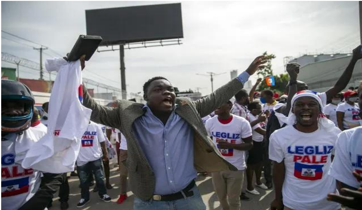
Photo of Haitian Christians protesting against gay marriage in Haiti on Wednesday, July 6, 2020.

homosexual men in Haiti negotiate their sexual identity while navigating intimate transnational relationships with their migrant partners in Haiti, where anti-homosexual attitudes are mobilized for political and religious gain.