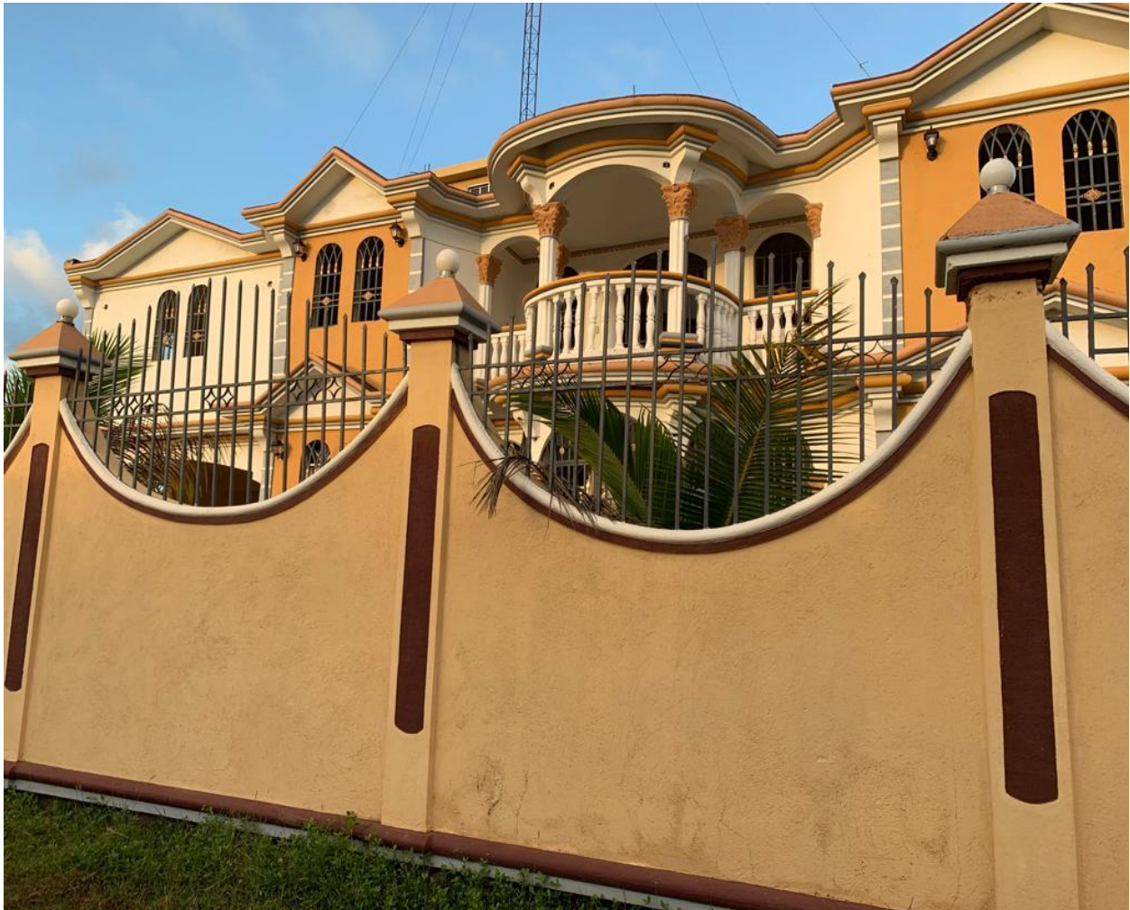
A house built with migrant remittances in Northern Haiti. Photo taken in one of the neighbourhoods where I conducted my fieldwork in 2021.