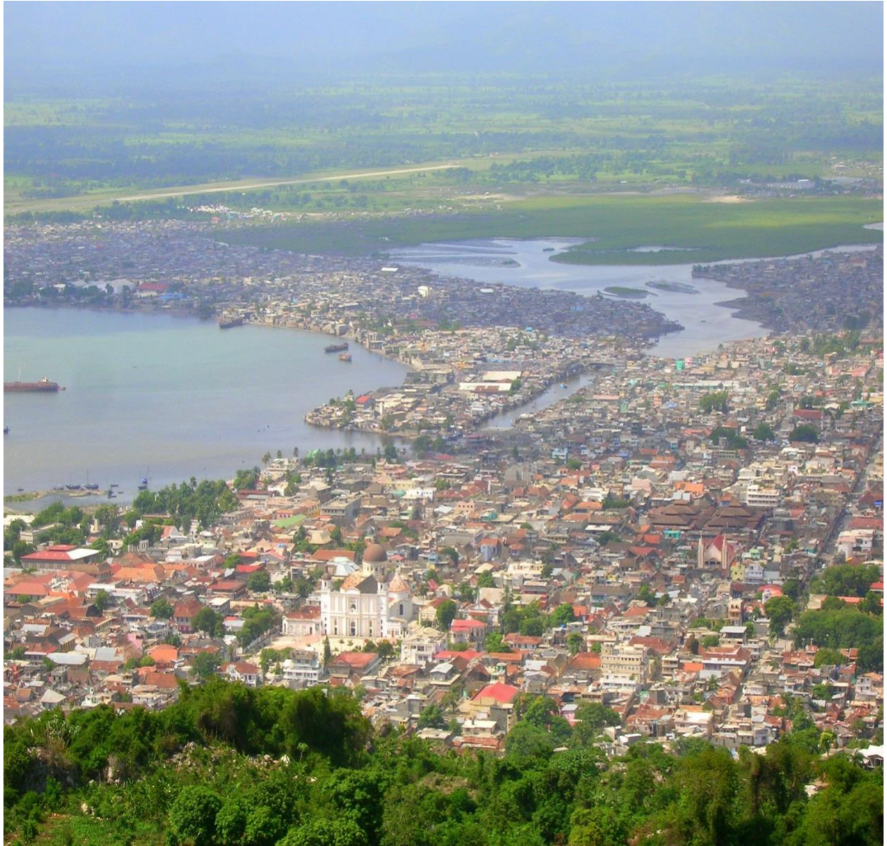
Photo of Cap Haitian and its suburbs in Northern Haiti. Photo retrieved on July 7 th , 2023.