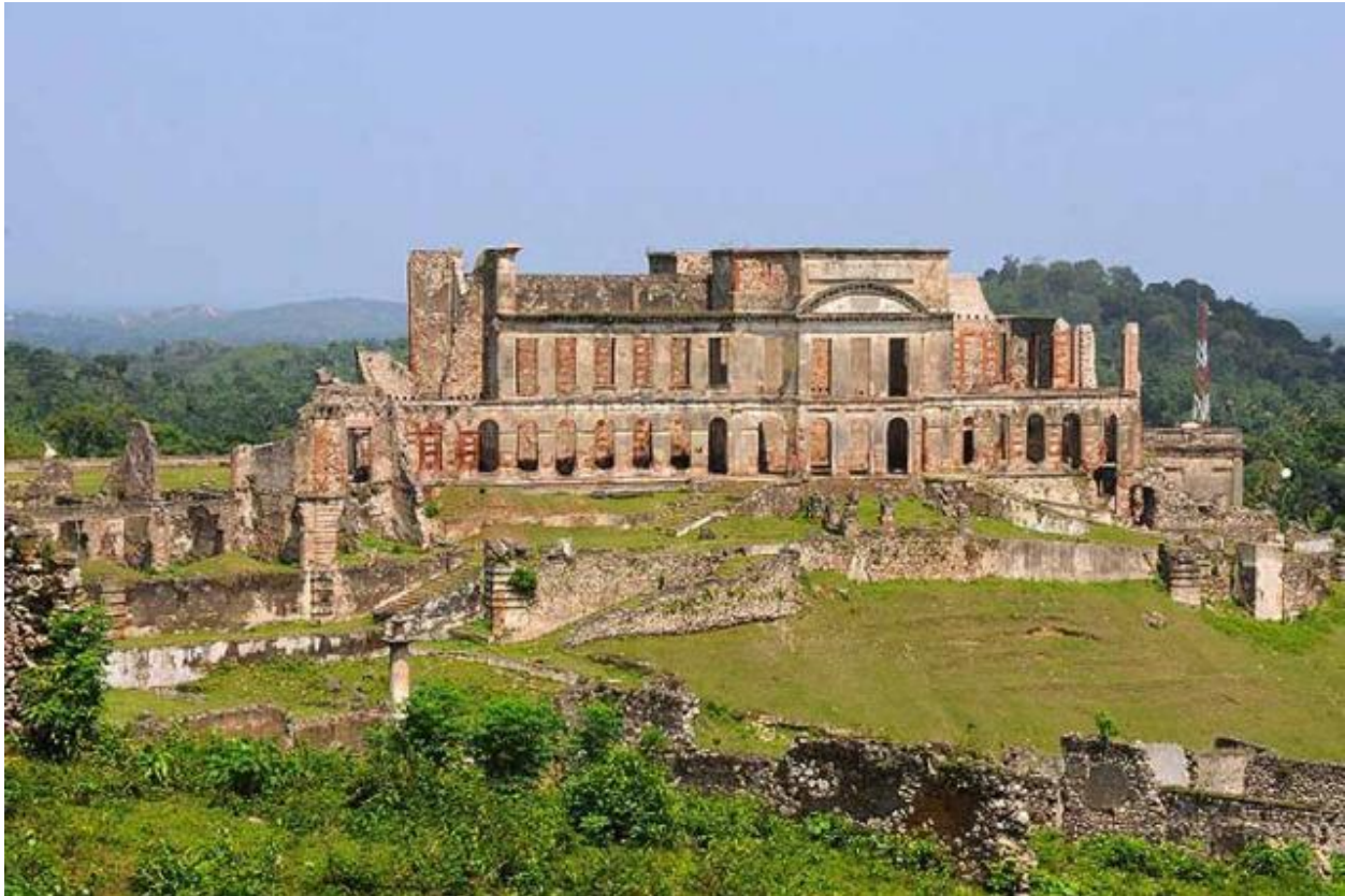
Photo of Sans Souci Palace. Photo retrieved on July 7 th , 2023.

prideful historical monuments, Northern Haiti, like the rest of the country, is shaped by significant socioeconomic inequalities that structure local populations' living conditions. Socioeconomic inequalities in contemporary Haiti are both a product of history and internal socio-political instability, contributing to the 'multidimensional vulnerability' (Audebert 2017) of living conditions in Northern Haiti.