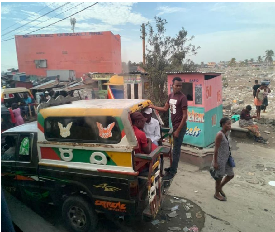
Public Transportation in Northern Haiti Photo taken during my fieldwork in 2021.

The education system in Northern Haiti is severely underdeveloped, lacking school materials and equipment to function. The hundreds of schools across the region cover only elementary and primary education. Most students in rural areas face the decision to stop school altogether after completing their 5 th grade or move to urban areas to pursue secondary education. Those who do not have the means to move to other towns and cities cannot easily reach their schools as public transportation is scarce, unreliable, and expensive in the region. Many schools also struggle to recruit instructors and staff. While the government publicly funds schools, employees must wait several months to receive their salaries. This situation often results in frequent strikes, affecting school programs and calendars.