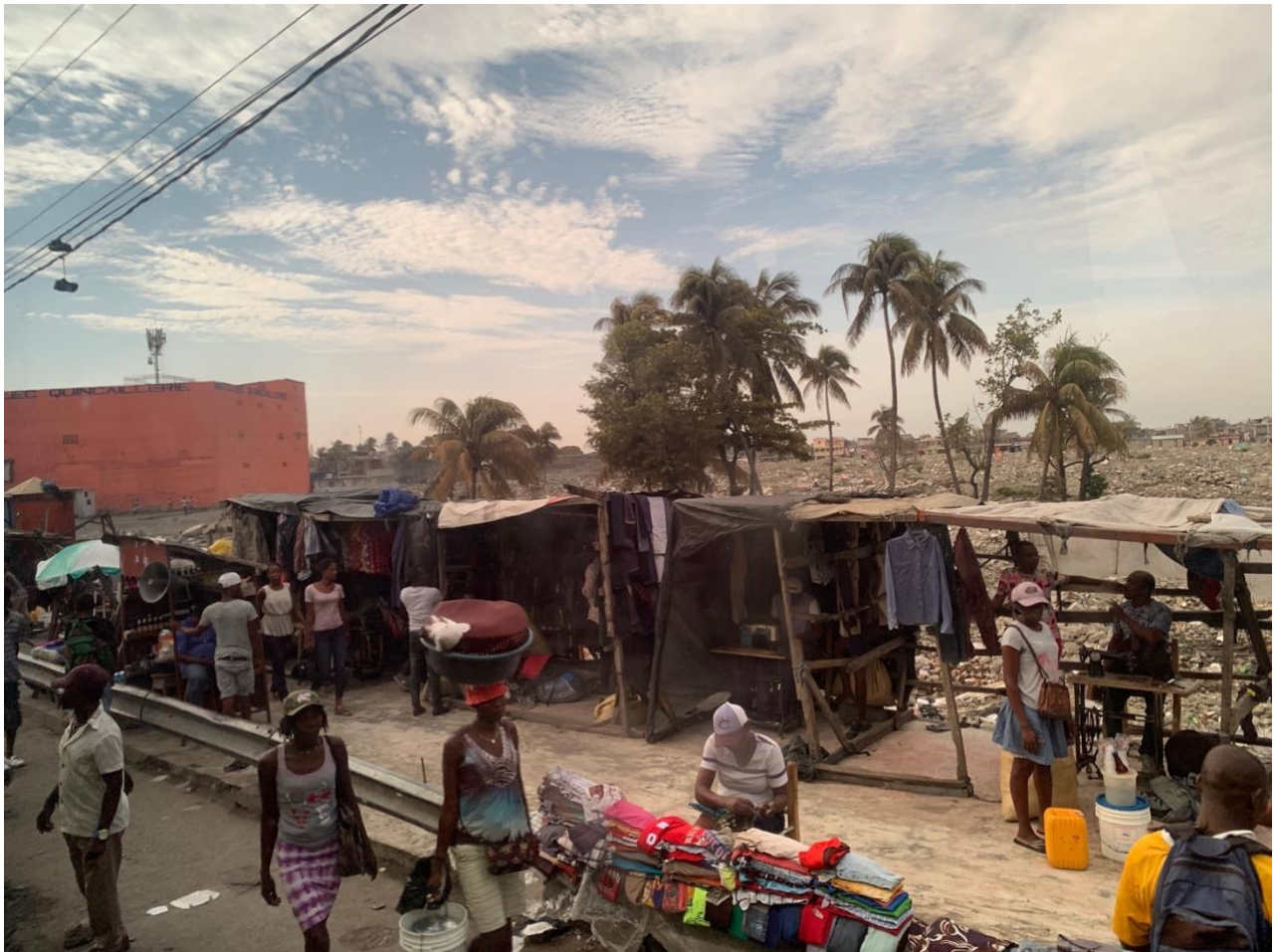
One of the street markets in Northern Haiti. Photo taken during my fieldwork in 2021.