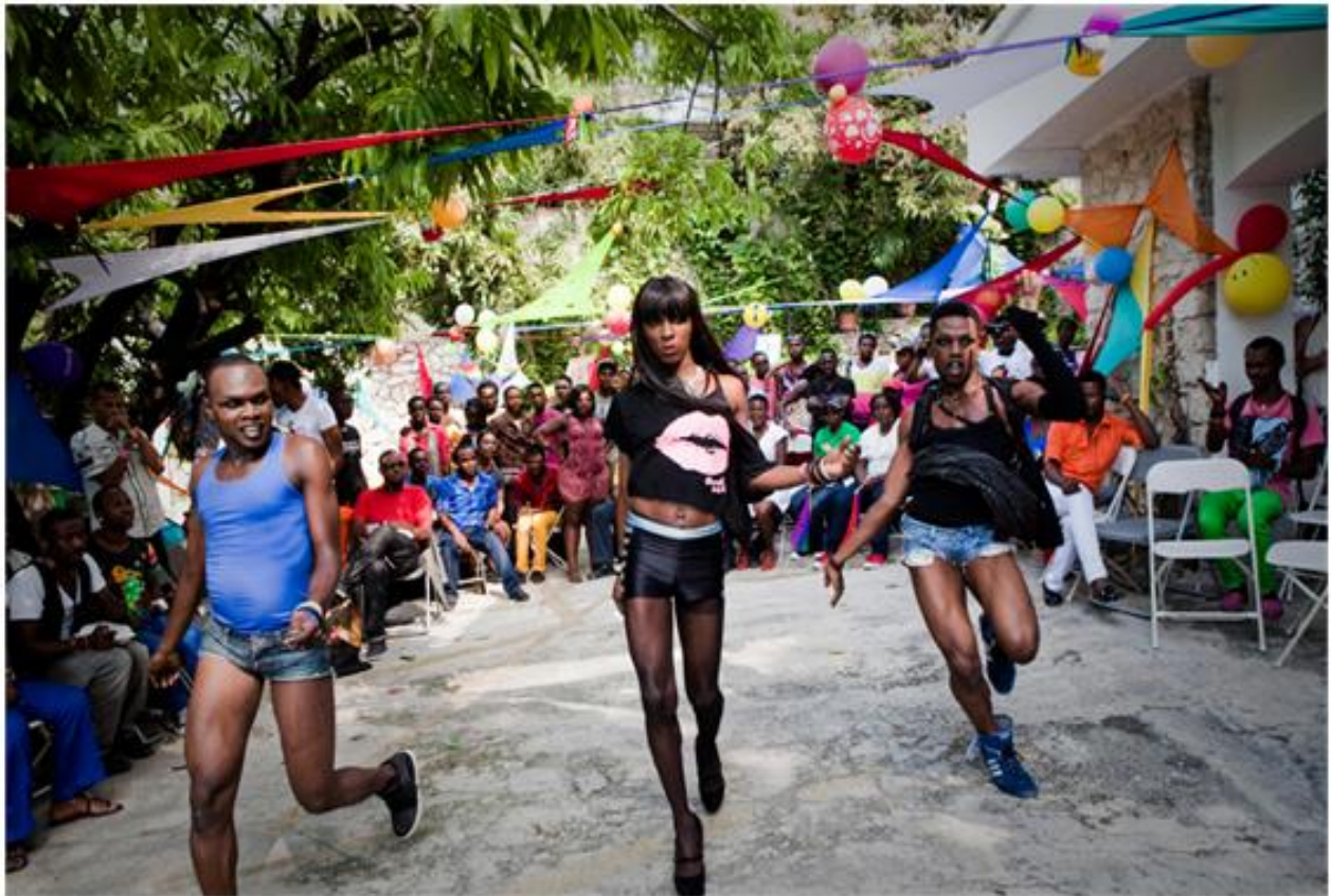
Publicly available photo of a Masisi defile in Haiti.