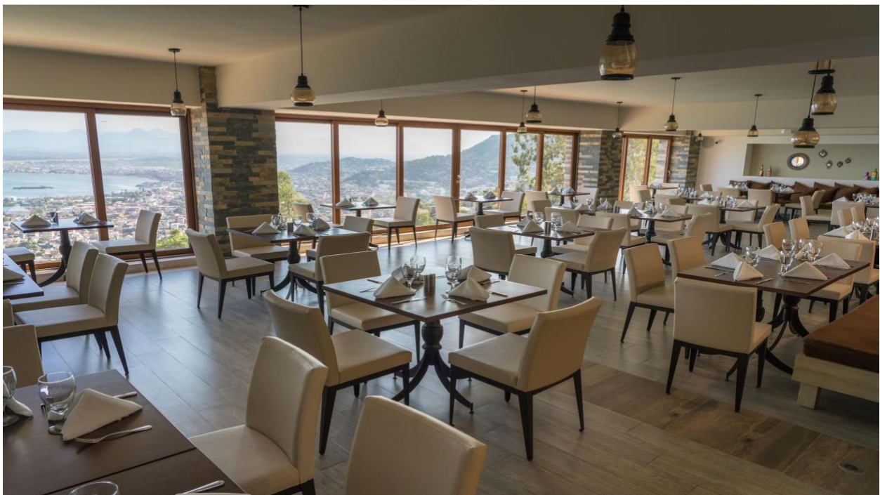
A High-end Hotel Restaurant in Cap-Haïtien. Photo in 2021 during my fieldwork in Northern Haiti.

relationships. The higher economic resources they bring from their host societies to the impoverished context of Haiti empower Haitian migrants to do ‘things’ in Northern Haiti that many nonmigrants, who could be great same-sex intimate partners, cannot do. These things can be anything, from migrants simply paying a phone bill or a meal during their visits to Haiti to sending regular remittances to care for their nonmigrants and their families in Northern Haiti. These things mean a lot in nonmigrants’ lives in Northern Haiti.