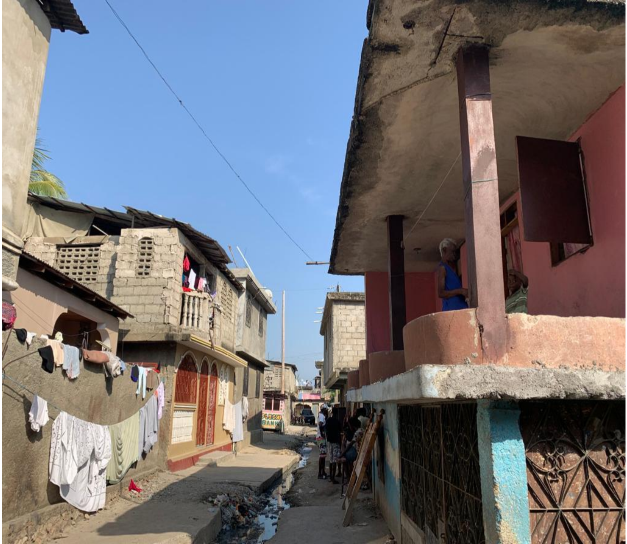
One of the neighborhoods in Cap Haitian where I conducted my fieldwork. Photo taken in 2021.