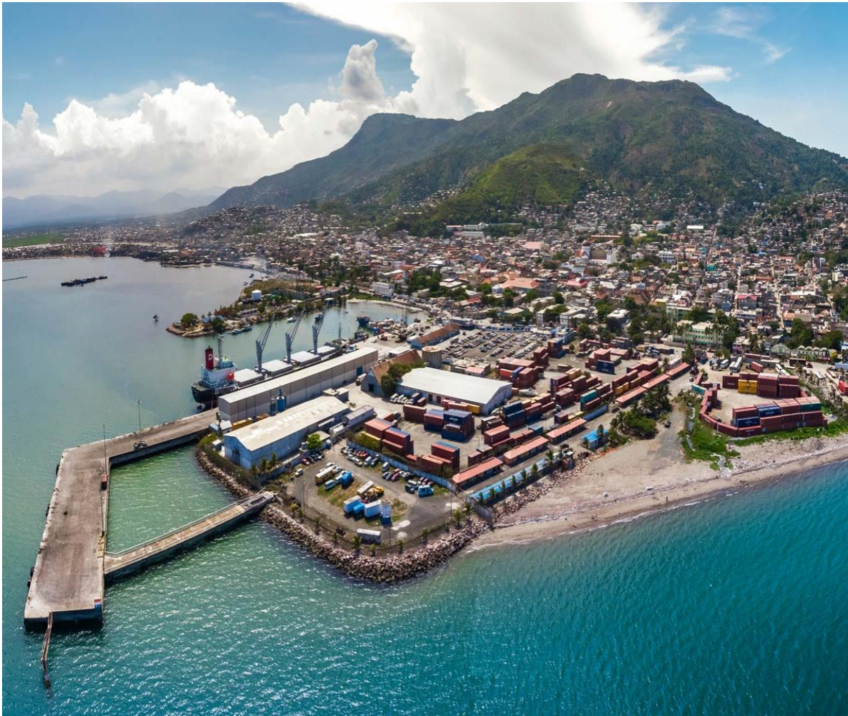
© Copyright: Haiti Libre: International Port of Cap Haitian, where imports arrive from the Haitian diaspora. Photo Retrieved on July 7 th , 2023.