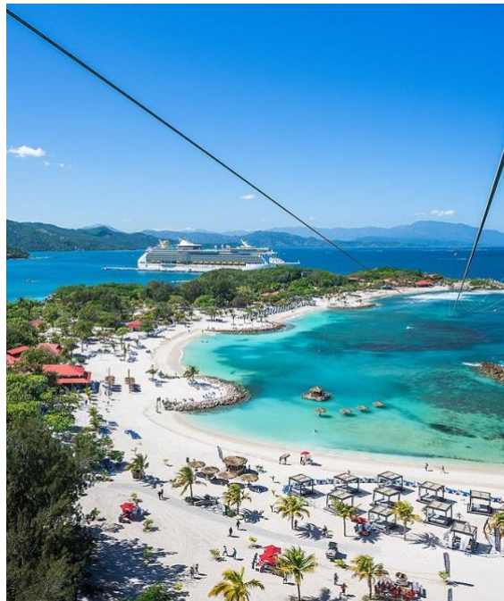
Photo of Labadee

Regarding tourism, the northern region of Haiti is home to internationally renowned beaches, including Labadee, Cormier, Tortuga Island, and Amiga Island. Labadee is a private resort leased to Royal Caribbean Cruises Ltd for the exclusive use of passengers until 2050 14 . Royal Caribbean has contributed the most significant tourist revenue to Haiti since 1986, employing 300 locals 15 and paying the Haitian government US$12 per tourist 16 . While Labadee serves as a port and resort for an international tourist population, mainly comprising Westerners, other beach areas such as Cormier, Amiga Island, locally known as île-à-Rats , and Tortuga Island are places where affluent segments of the Haitian people, foreign international aid workers in Haiti, and migrants from the Haitian diaspora go on vacation.