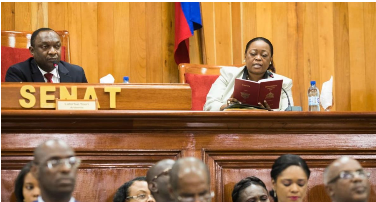
Photo of the Haitian Senate prohibiting gay marriage in Haiti on Wednesday, August 2, 2017. Photo retrieved on July 7 th, 2023.