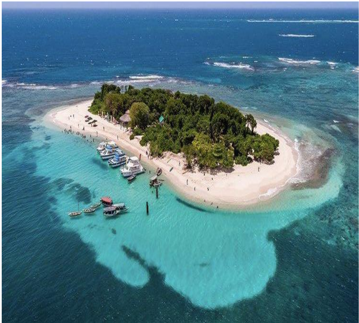
© Copyright Royal Tour Labadee: Île-à-rats Island, where Haitian migrants often go on vacation while visiting Northern Haiti. Photo retrieved on July 7 th , 2023.

pools and lobby at high-end hotels, etc. in Cap Haitian where the migrant sojourns; and some chita bay blag (hanging out in people's house or front yards) and Sòti (going out) time at the bar restaurants on the Boulevard. Therefore, these places were critical ethnographic sites for me to observe how resource inequality between migrants and nonmigrants shaped how the local population perceived Haitian migrants and the power dynamics that structured migrants-nonmigrants' relationships.