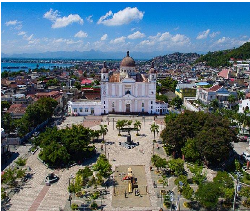
© Copyright Haiti Tour: Photo of Cap Haitian. Retrieved on July 7 th , 2023.

of its relative proximity to the Dominican Republic (DR) and Miami. These are two essential poles of the Haitian diaspora, where more affluent segments of the Haitian population in this region regularly travel to do commerce, go to the doctor, visit family members, shop, or go on vacation. Those who do not travel to these places hear accounts that Haitian travellers tell them upon their return. Therefore, the geographic location of Northern Haiti, its tourist attractions, and its relative political stability and security compared to Haiti's capital city, Port-au-Prince, make it an ideal place for men in Haiti and its diaspora to meet, develop, and maintain same-sex intimate transnational relationships.