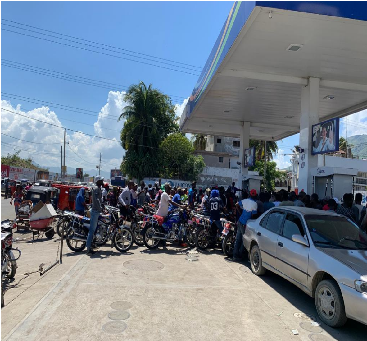
Line up in a Gas Station in Cap Haitian because of the gas crisis in Haiti Photo taken during my fieldwork in 2021.

The oil crisis has impacted the region's living costs as many small businesses, telecommunication companies, hospitals, clinics, schools, and transportation services depend on purchasing gas to operate their daily activities. Like in many countries, inflation affects the most vulnerable people in Northern Haiti, who constitute most of the population. This has increased