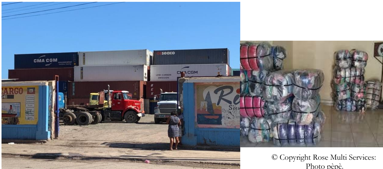
Containers with migrants' imported goods. Photo taken during my fieldwork in 2021.

to imports, these groups control key positions in most government institutions in Northern Haiti, such as ports, the airport, the planning department, the education ministry, the health ministry, as well as the Direction Générale des Impôts and the Office National D'Assurance Vieillesse , Haiti's tax and pension agencies, where money is often embezzled to fund private entrepreneurial activities. Other lower middle-class members in Northern Haiti obtain their socioeconomic status via importing and retailing recycled furniture, house appliances, and clothing, as well as used cars that their families in the Haitian diaspora buy and send to them by boat.