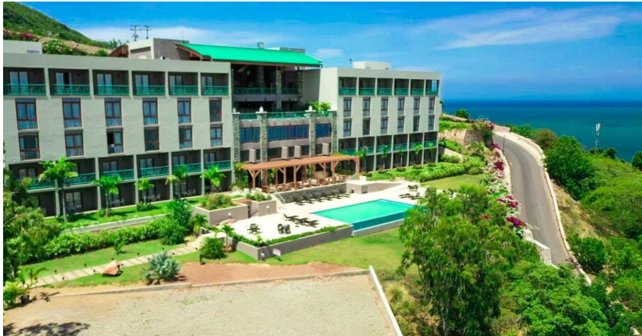
© Copyright: Hotel Satama, where Haitian migrants often spend their vacation in Northern Haiti. Photo retrieved on July 7 th , 2023.

The Boulevard is the entertainment district of Cap Haitian, where the most important and famous bars and restaurants, such as Lakay , Gwòg , Cap Déli , Boukanye , Barik , Deco , etc., are located. Because of their locations near Cap Haitian Bay, they are the favourite places for the local population and Haitian migrants to go for one or two drinks alone or with friends and family during the day or at night. These bar-restaurants are also where major Haitian artists and musical groups perform when they come to the northern region. These bar restaurants are also venues where cultural events are regularly organized, including beauty pageants, slam/poetry sessions, music and painting competitions, and fashion runway shows.