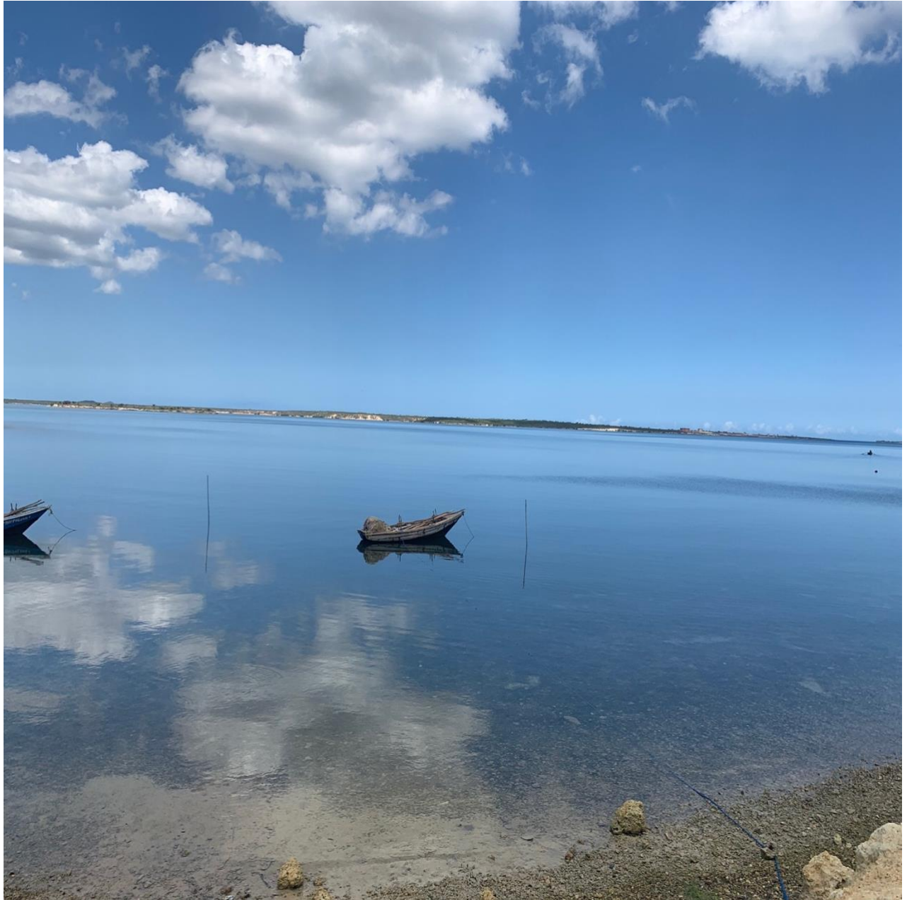
Photo taken in Fort Liberté during my one of my last days of fieldwork in Northern Haiti in 2021.