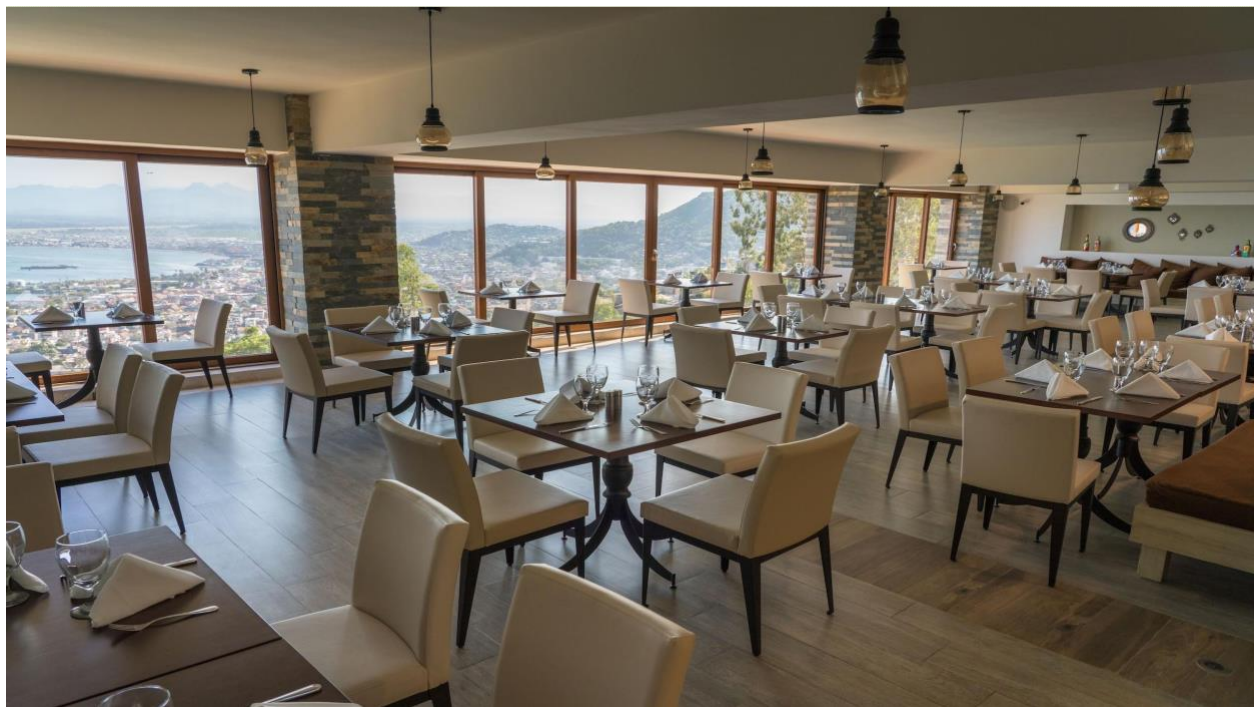
A High-end Hotel Restaurant in Cap-Haïtien. Photo in 2021 during my fieldwork in Northern Haiti.

relationships. The higher economic resources they bring from their host societies to the impoverished context of Haiti empower Haitian migrants to do ‘things’ in Northern Haiti that many nonmigrants, who could be great same-sex intimate partners, cannot do. These things can be anything, from migrants simply paying a phone bill or a meal during their visits to Haiti to sending regular remittances to care for their nonmigrants and their families in Northern Haiti. These things mean a lot in nonmigrants’ lives in Northern Haiti.