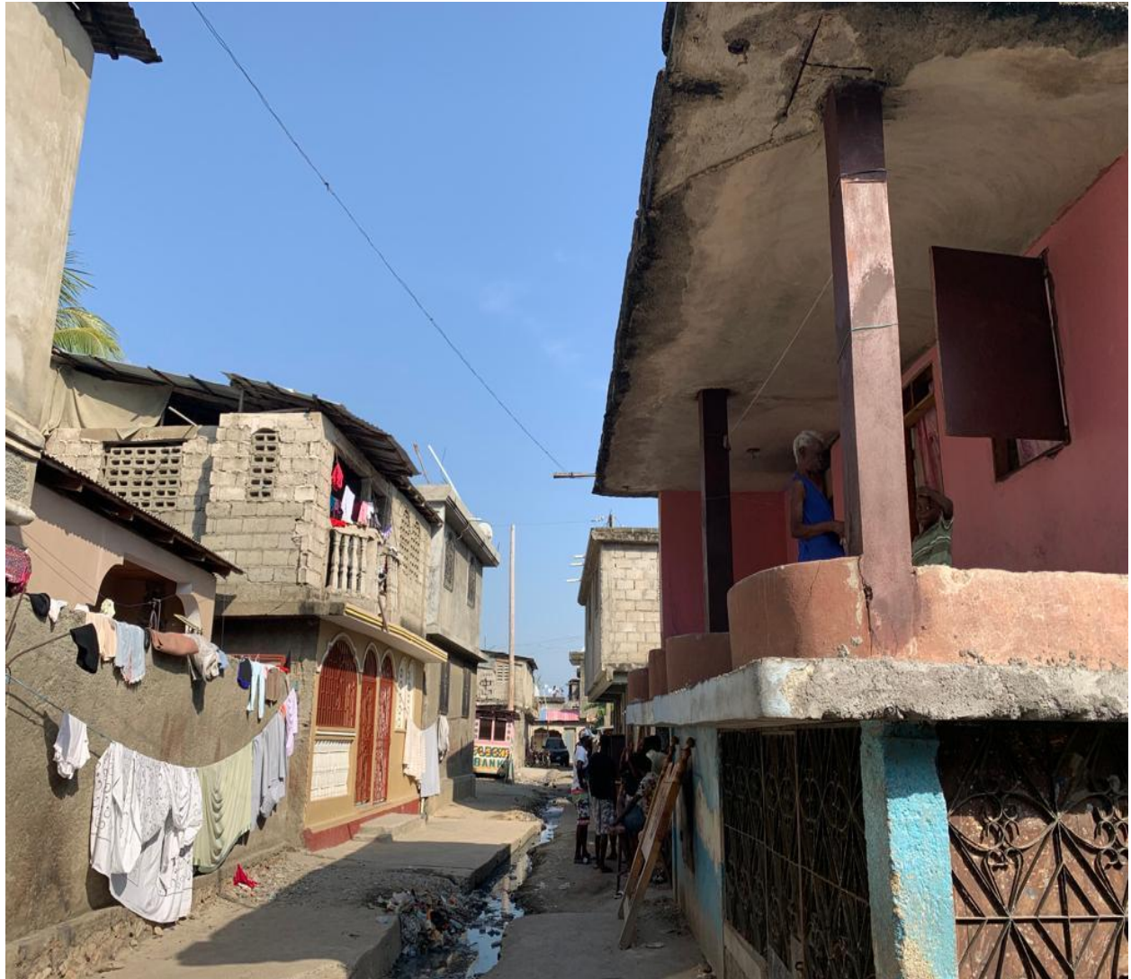
One of the neighborhoods in Cap Haitian where I conducted my fieldwork. Photo taken in 2021.