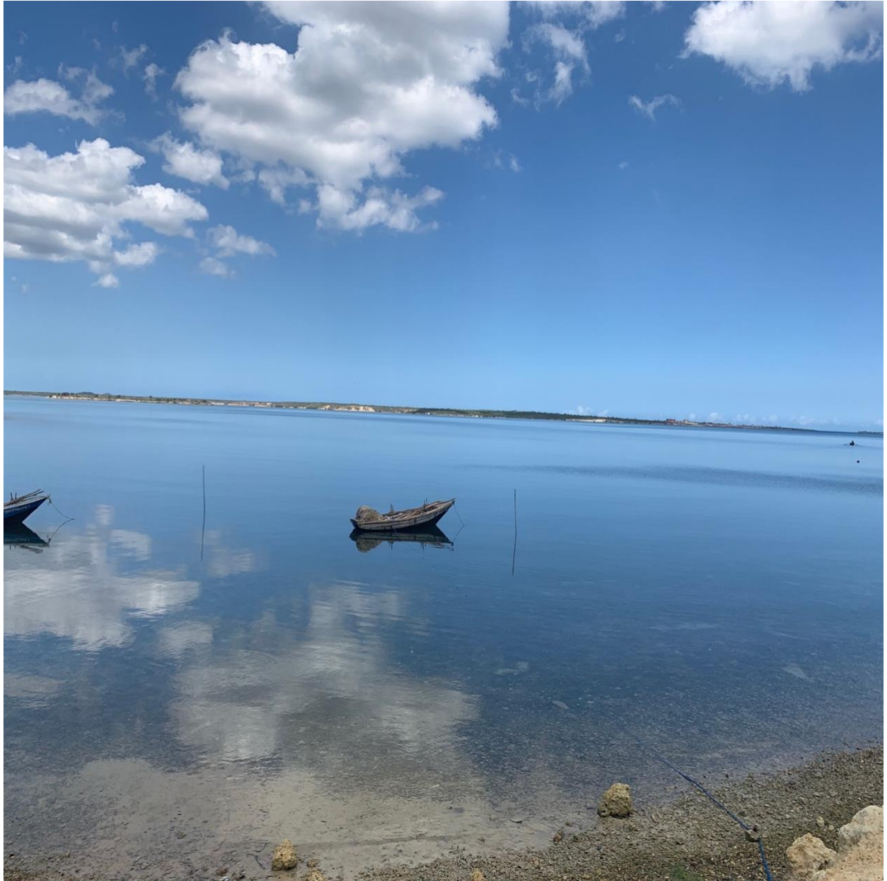
Photo taken in Fort Liberté during my one of my last days of fieldwork in Northern Haiti in 2021.