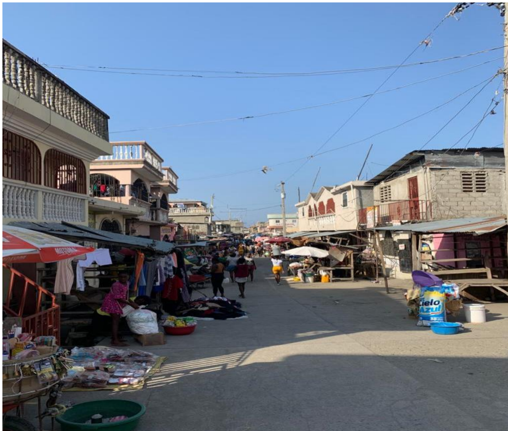
Photo of a neighborhood where I conducted my fieldwork in Northern Haiti in 2021.

The chita bay blag sessions allowed them to re-strategize as a group and determine how to respond to specific situations, especially in the face of discrimination due to their gender and sexual orientation. Occasionally, these sessions became heated when one friend made a pass to another friend's intimate partner or boyfriend or if they suspected that their partner was cheating on them with someone they knew, such as a close friend who may belong to the same network. While these sessions provided them with an opportunity to gather and chat about their collective conditions as gay men in Northern Haiti's context, they could also be spaces of tension and mistrust because of the threat of losing one's boyfriend to someone close. As I discuss in chapter five on the meanings of gay migrant remittances in these intimate transnational relationships, losing a migrant boyfriend can be costly to some gay men in Northern Haiti. Therefore, they navigated these friendship networks cautiously while finding comfort and happiness in hanging out with their gay friends.