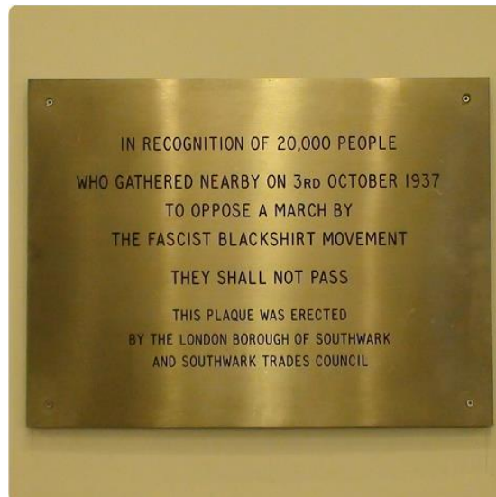
Figure 4: Commemorative Plaque of the October 1937 March in Bermondsey 210

While being caught by accident in the demonstration, Marcus ends up rallying the anti-fascist movement and even finds himself say “Oh, God! They’ll bring order alright, if we let them. The order of death. That’s why we’ve got to stop them.” (337) If Marcus surprises himself by this act, it is actually a prolongation of what he actually proclaimed in private while defending his partner Jack when their social entourage were being utterly antisemitic and homophobic (“I think you’d better know that I’m a pansy boy. And the man I live with is a Jew.” 298) By investing Marcus with a double political cause, Wilson fashions an ethical interstice who defends minorities by small yet impactful incursions in the novel. In fact, Marcus’s reaction to his joining the protest provokes the “emergence of these two identities, though irritating to Marcus, released him from his increasingly anxious isolation.” (337) Marcus is both self-centred and ethically committed to others through his political awakening, for the paradoxical association of anonymity and connection with the angry crowd results in a mix of “intense excitement” (341) and of the “fear of being cut off from Marcus Matthews.” (338) The demonstration acts itself as a political and ethical parenthesis within the novel, which sees Marcus recognise and stand up for others. He therefore embodies the ethics of responsibility, as defined by Paul Ricœur in his 1992 talk “Fragility and Responsibility”: