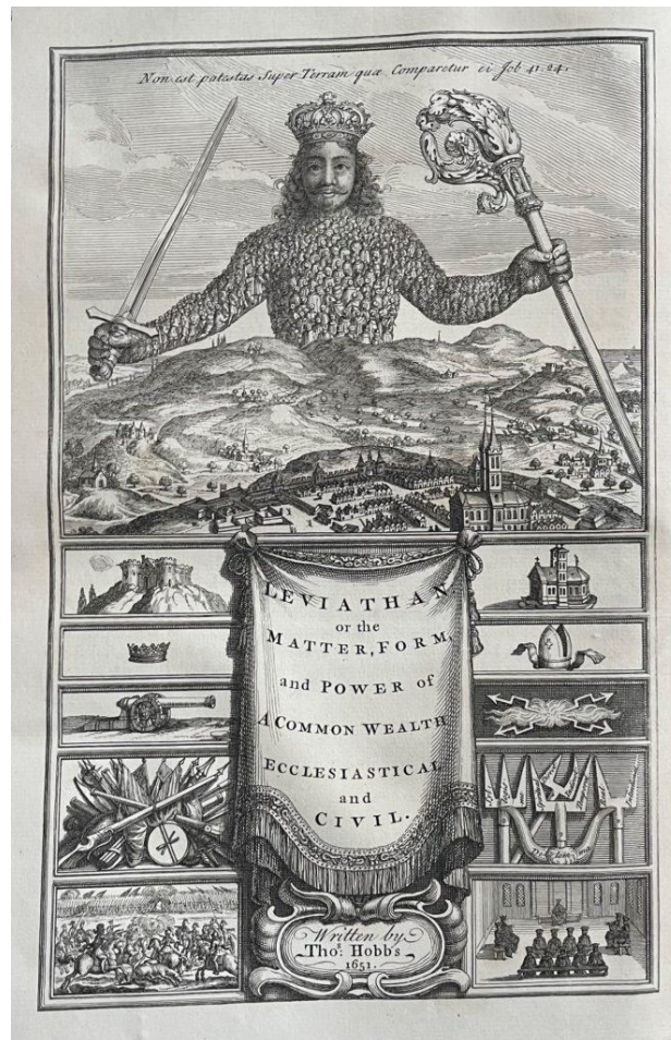
Figure 3: Frontispiece of Thomas Hobbes' Leviathan by Abraham Bosse, 1651

Overlooking his kingdom, the King stands here as a uniting figure. His body is here composed of individuals looking up to him, representing the social contract à la Hobbes: for Hobbes, the King is the sole human being capable of ensuring the safety and viability of the country. The body politic is therefore incarnated by the sovereign and his subjects through a relationship of wilful subordination. The dominating figure of the King in the frontispiece echoes Snaith's own power-driven position. Yet, Snaith – as opposed to an absolute monarch – is part of an elected political organ, supposed to answer to the will of the people and to the collective interest. His power plays in fact reveal that something is rotten in the Kingdom of England: Snaith is indeed intent on “gambling with human nature” (464) and “reaping profits for himself” (442). By buying land before selling it to the Council he works for, Snaith is the embodiment of the “Corruption” (3) with a capital C, denounced in the Prologue of the novel. If the South Riding's County Council is in fact “World Tragedy in embryo” (3), one can perceive how money and self-interest interfere with the political system.