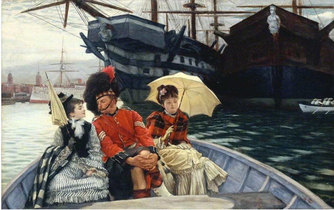
James Tissot, Portsmouth Dockyard (Between The Two My Heart is Balanced) , 1877, Tate Gallery, London. https://www.tate.org.uk/art/artworks/tissot-portsmouth-dockyard-n05302