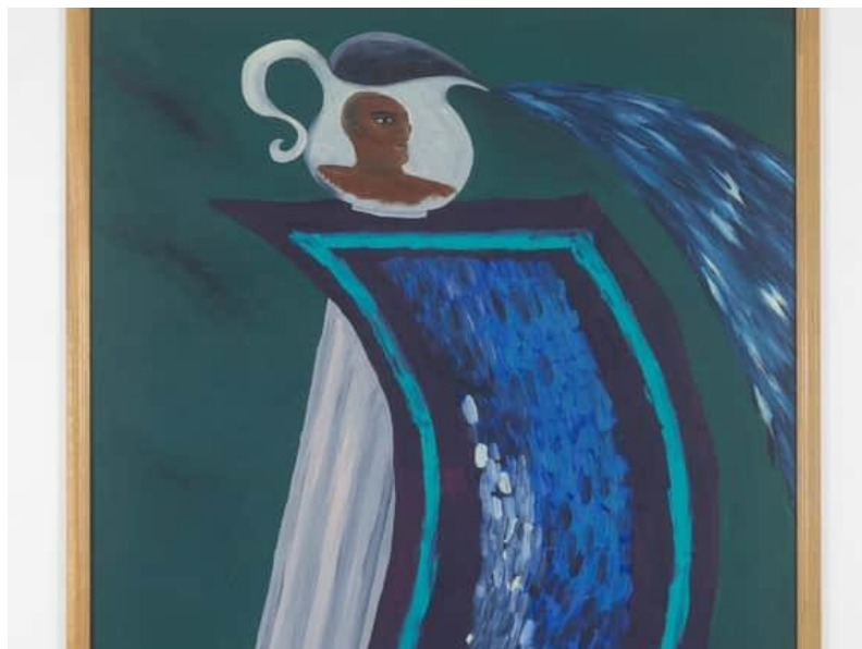
Lubaina, Himid. Memorial to Zong , 1992, Lancaster Maritime Museum. England. https://ibaruclan.com/exhibition-lubaina-himid-memorial-to-zong-at-lancaster-maritime-museum/