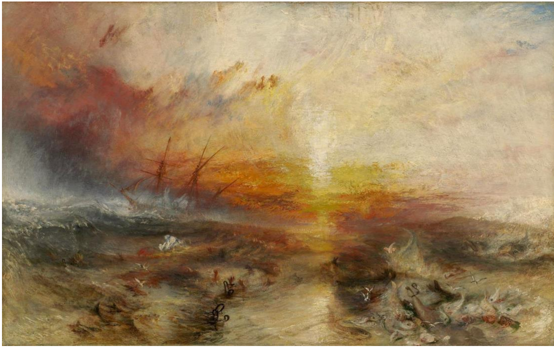
J.M.W. Turner, Slavers throwing overboard the Dead and Dying—Typhoon coming on (The Slave Ship) , 1840, Museum of Fine Arts, Boston. https://customprints.mfa.org/detail/476114/turner-slave-ship-slavers-throwing-overboard-the-dead-and-dying-typhoon-coming-on-1840