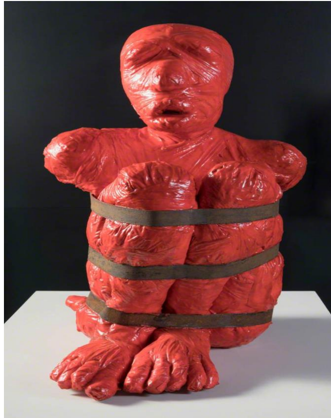
Francois Piquet, Timalle . 2017, International Slavery Museum, Liverpool, England. https://artuk.org/discover/artworks/timalle-288028