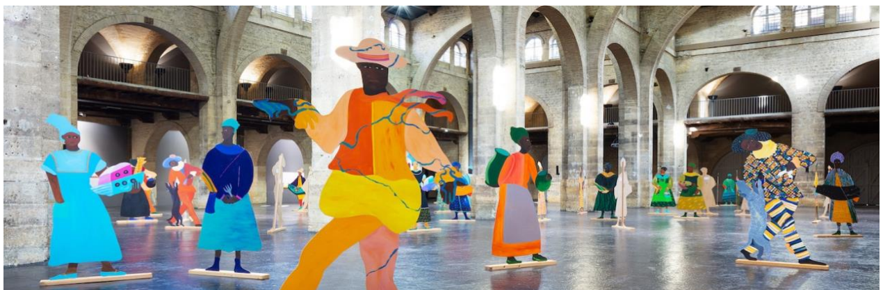
Lubaina Himid, Naming the Money , 2004, CAPC Bordeaux. https://www.capc-bordeaux.fr/agenda/expositions/lubaina-himid-naming-money