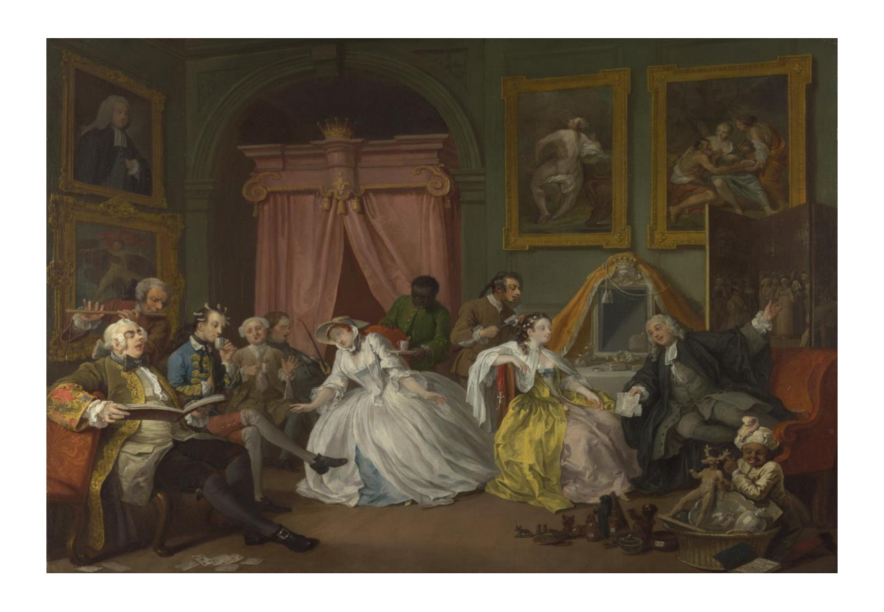
William Hogarth. Marriage A-la-Mode: 4, The Toilette . Oil on canvas. 69.9 x 90.8 cm. The National Gallery, 1743. https://www.nationalgallery.org.uk/paintings/william-hogarth-marriage-a-la-mode-4-the-toilette