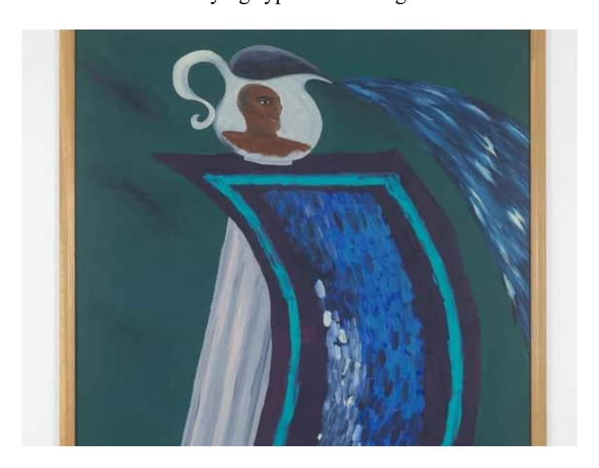
Lubaina, Himid. Memorial to Zong , 1992, Lancaster Maritime Museum. England. https://ibaruclan.com/exhibition-lubaina-himid-memorial-to-zong-at-lancaster-maritime-museum/