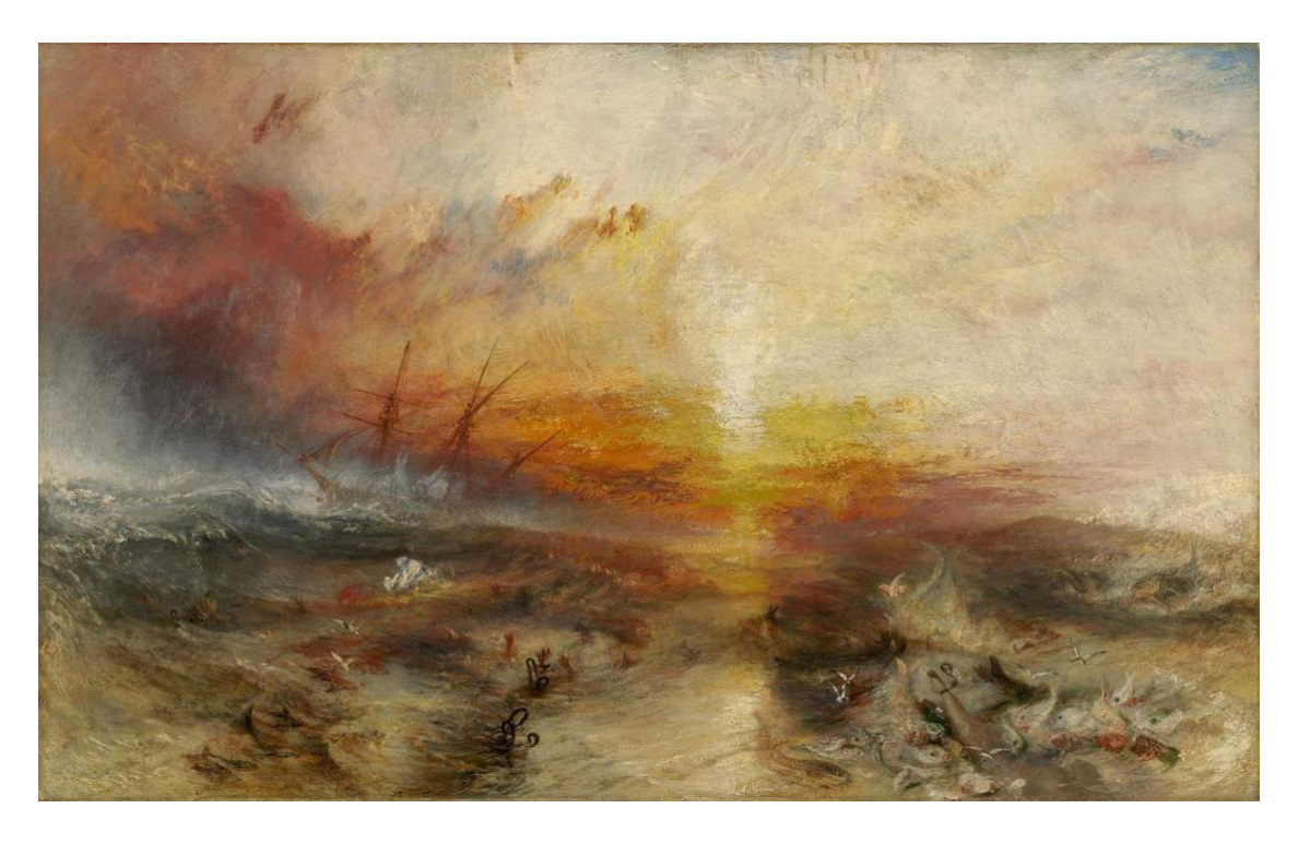
J.M.W. Turner, Slavers throwing overboard the Dead and Dying—Typhoon coming on (The Slave Ship), 1840, Museum of Fine Arts, Boston. https://customprints.mfa.org/detail/476114/turner-slave-ship-slavers-throwing-overboard-the-dead-and-dying-typhoon-coming-on-1840