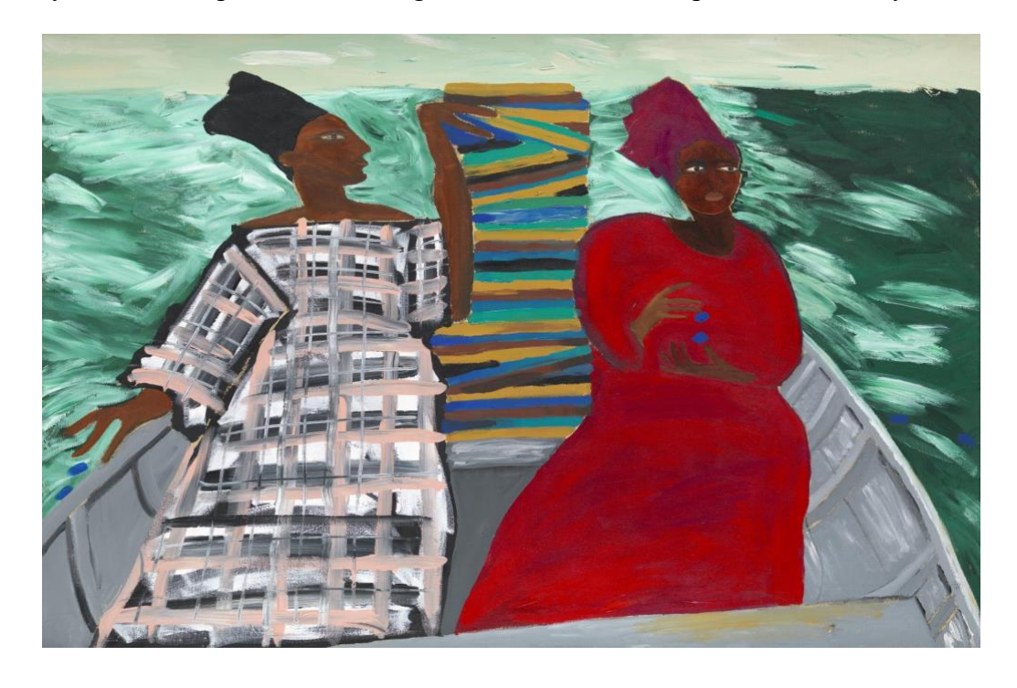
Lubaina Himid, Between the Two my Heart is Balanced , 1991, Tate Gallery, London. https://www.tate.org.uk/art/artworks/himid-between-the-two-my-heart-is-balanced-t06947