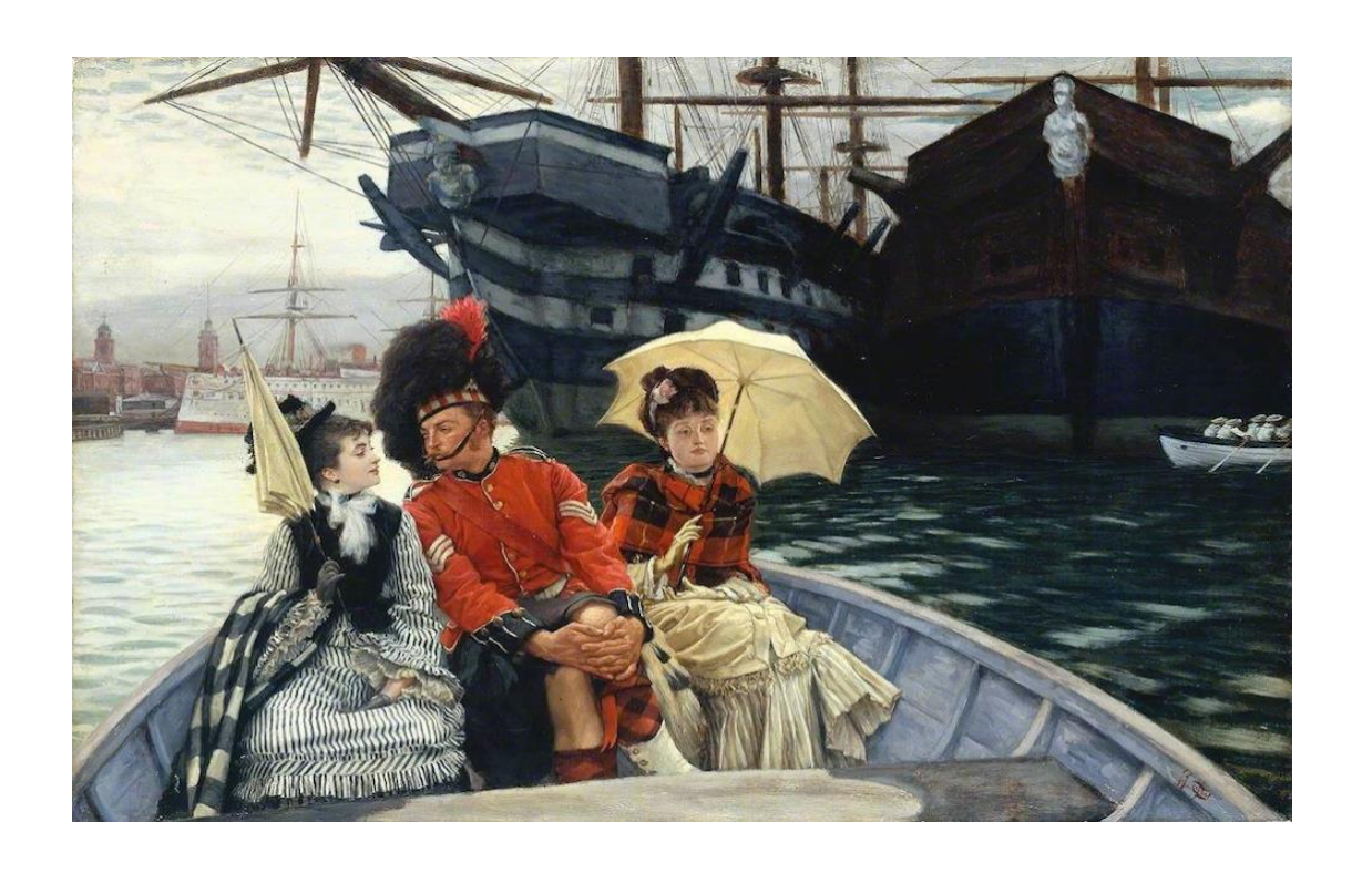
James Tissot, Portsmouth Dockyard (Between The Two My Heart is Balanced), 1877, Tate Gallery, London. https://www.tate.org.uk/art/artworks/tissot-portsmouth-dockyard-n05302