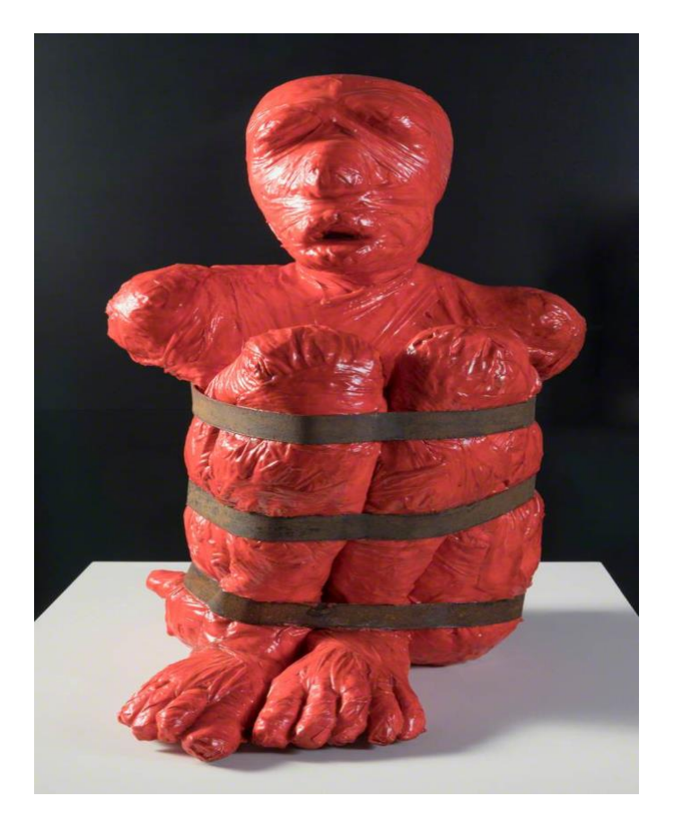
Francois Piquet, Timalle . 2017, International Slavery Museum, Liverpool, England. https://artuk.org/discover/artworks/timalle-288028