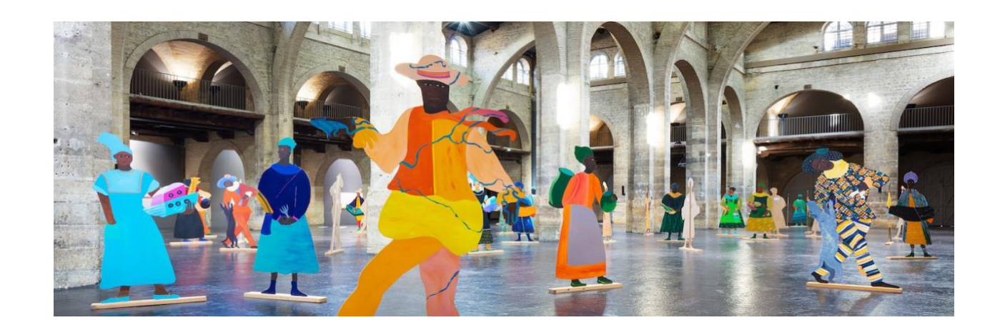
Lubaina Himid, Naming the Money , 2004, CAPC Bordeaux. https://www.capcbordeaux.fr/agenda/expositions/lubaina-himid-naming-money