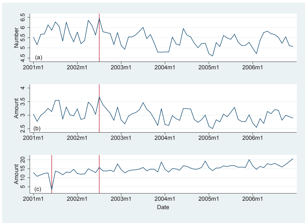
TABLE 1.2: Graphical Representation of The Evolution of Payment Series Over Time

Notes. (a) represents the count of cleared ATM withdrawals and (b) represents the corresponding amount. (c) represents the amount of cleared card transactions. All amounts are deflated, and given in billion of euros. The count of ATM withdrawals is given in 10 million of euros. The vertical red line on (a) (b) and (c) corresponds to July 2002. The leftmost red line in (c) is the month of June 2001 and corresponds to the "Yescards" crisis.