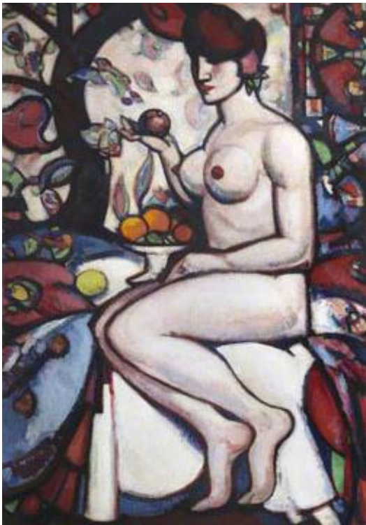
Fig. 2 Fergusson, J.D. 'Rhythm.' 1911.

classical artistic depictions of the female figure, Erna's body is transformed into cultural object – she is a nude rather than a naked woman (Ussher 3). But the aesthetic is not Classic. Erna has the head of an ugly woman on top of her swimmer's body – the French reads 'sur un corps de nageuse une tête' where 'a body' continues a façade of objectivity and an abstractness of person. These harsh and ugly building blocks echo modernist depictions in which 'the body, freed from cosy roundness, could appear in terms of stylised geometry with harsh lines and stiff angles' (Levenson 46). Erna fits visually into German expressionism, or cubist collage – exoticised and geometrised like Picasso's women in 'Les Femmes d'Alger' (1907) – with the body broken up in art. With her smooth surfaces and geometric shapes, she seems to have depth even on the page. But does this depiction challenge traditional representations of woman as Other or simply reinterpret the Other for the (male) avant-garde artist?