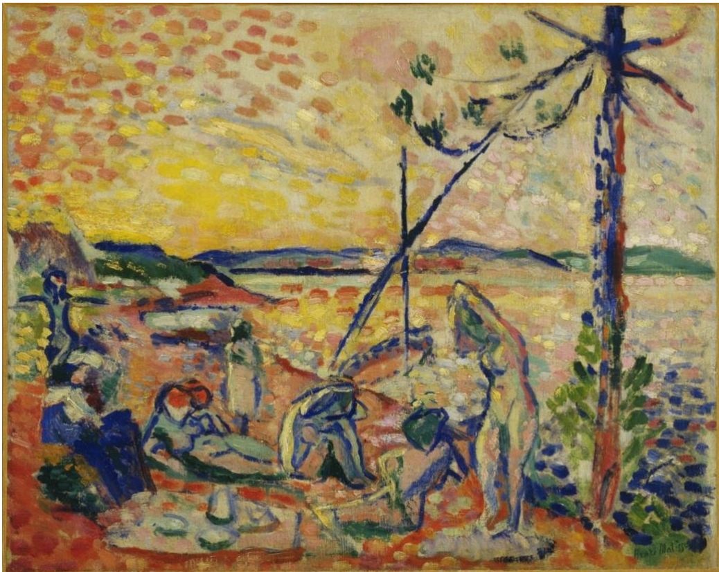
Fig. 3 Matisse, Henri. 'Luxe, calme et volupté.' 1904.

The fact that Erna's exotic irregularity, which the boys at first declared ugly, is here luxurious and rich, signals a shift in traditional conceptions of beauty. With the avant-garde having dispensed of convention and experimentation having prompted aesthetic debate, Erna's strange shapes can emerge wondrous and beautiful. When Erna moves to a corner of the mason's shed and steps into the light cast by Manuel's Ubu lamp, the foreignness of the Berliner's face, as the narrator describes it, appears not ugly but perfect (105). Just as Jarry's play Ubu roi (1896) was a turning point for twentieth century theatre and absurdity, Ubu's presence in Battling alters the aesthetic through which we see. Its strangeness discards preconceptions and obliges us to question socialised meaning.